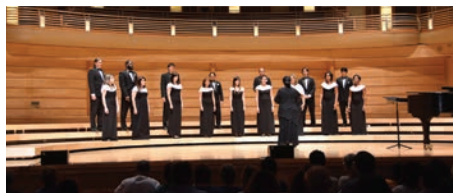
Coro Entrevoques of Cuba