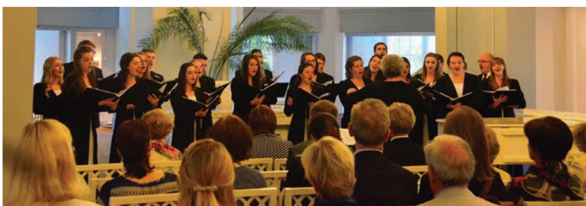
GWU Tartu performing at the White Hall