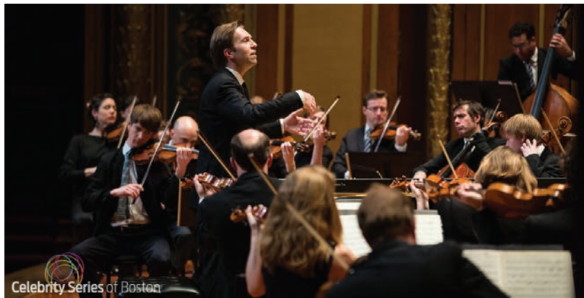
Leif Ove Andsnes conducts the Mahler Chamber Orchestra in Boston

"Throughout the Debussy — and throughout the concert — the orchestra reveled in warm, luxurious yet sharply alert sound."