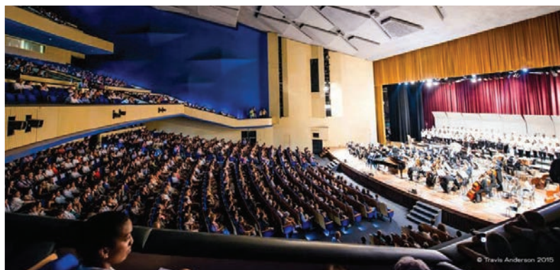
Minnesota Orchestra performs for a capacity crowd at Havana's Teatro Nacional

“The Teatro Nacional, a 2,056-seat theater on the Plaza de la Revolución, was sold out. Two dozen photographers and videographers swarmed the aisles. The Minnesota Orchestra’s concert here Friday night was greeted not only as a rare chance to hear an orchestra from overseas, but as a symbol of the rapprochement between the United States and Cuba.”