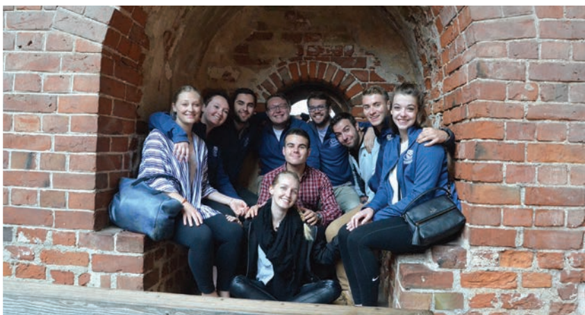
GWU Singers explore Trakai Castle near Vilnius, Lithuania