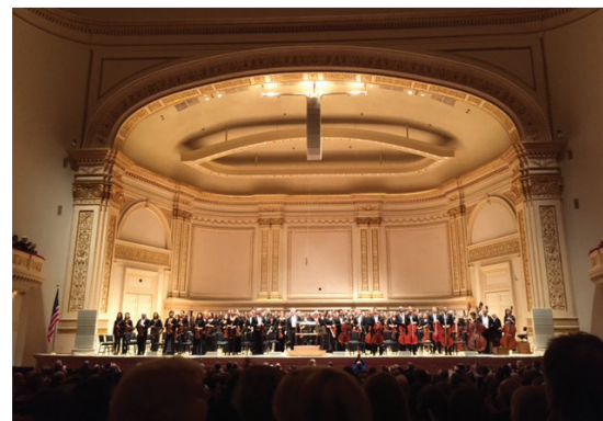
The Saint Louis Symphony and Chorus takes a bow after their performance at Carnegie Hall