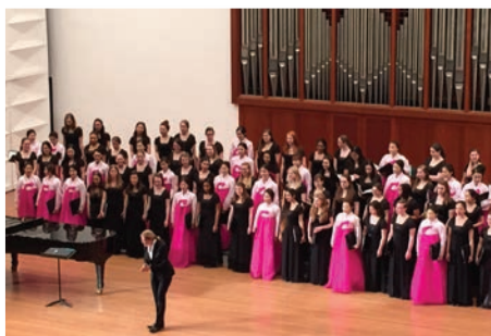
Wellesley College Choir performs alongside a Korean university women's choir

with warm and enthusiastic audiences. The choir performed two concerts with local choirs and a church service (with over 7,000 people in attendance!) in Seoul and one concert with a local choir in Daejeon .