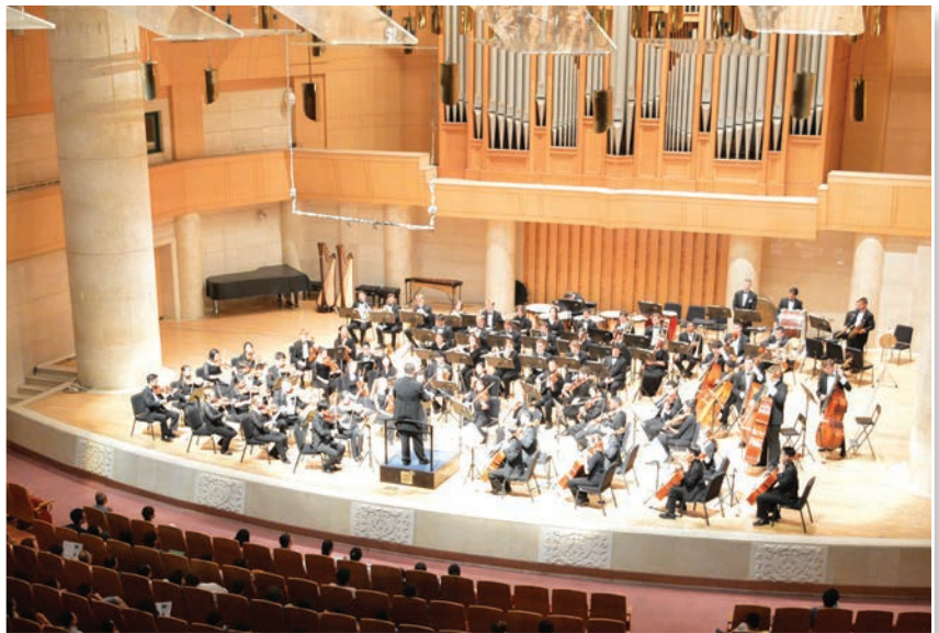
The Cleveland Orchestra Youth Orchestra performs at Beijing's Forbidden City Concert Hall