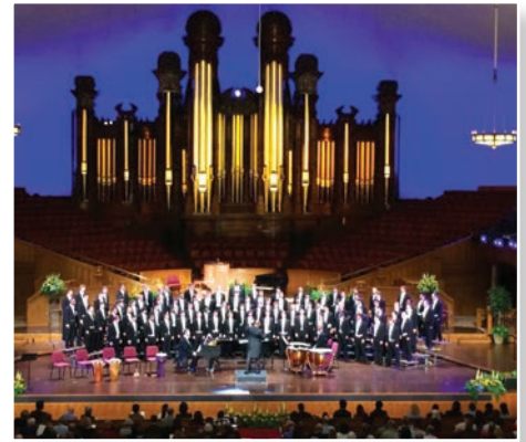
The University of Michigan Men's Glee Club performs at the Salt Lake Tabernacle