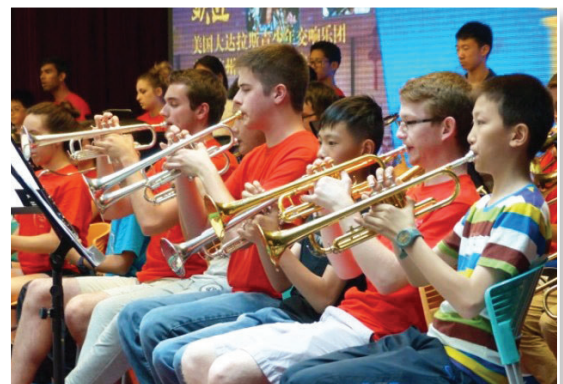
The Greater Dallas Youth Orchestra rehearse side-by-side with members of the Hangzhou Youth Orchestra