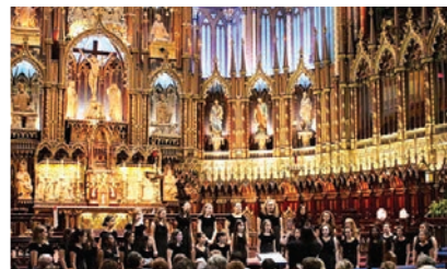
Princeton Girlchoir performs in the stunning Notre Dame Basilica in Montreal

One of their performances as part of the conference gave them the unique opportunity to perform in the distinctive Salt Lake Tabernacle. They explored Zion National Park on their way to Las Vegas , where they performed at the University of Nevada and saw the famous Las Vegas strip.