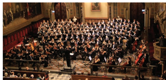
The Yale Glee Club performs Brahms' Requiem with local choirs and an orchestra in Barcelona