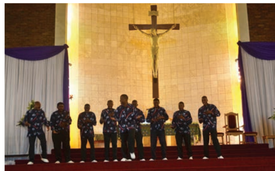
Imbizo performs a lively program