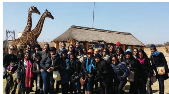
Soul Sounds visits the Heia Safari Ranch