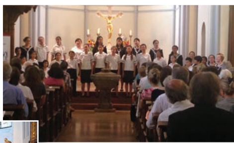
◀ Vancouver Children's Choir performs in Salzburg