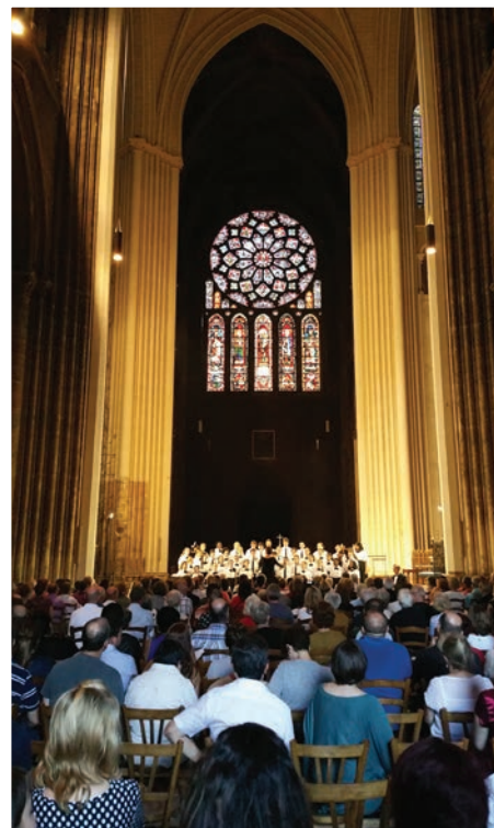
Children's Chorus of Washington onstage at Chartres Cathedral