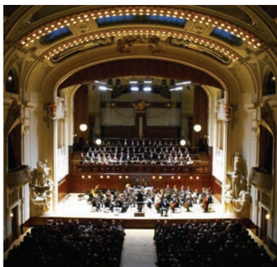
Anchorage Concert Chorus performs in Smetana Hall with the Prague Summer Nights Festival Orchestra