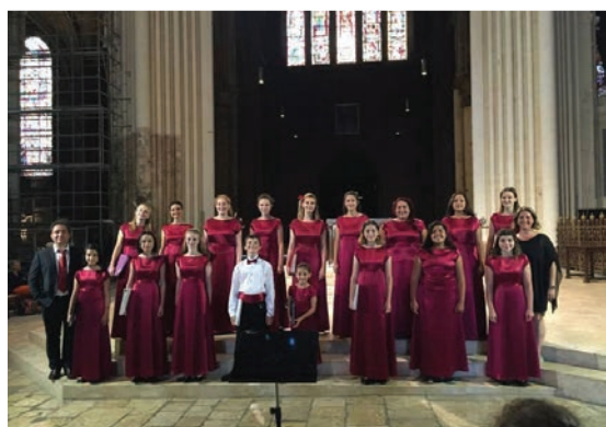
Musyca Children's Choir prepares to perform in Chartres Cathedral

"A rich performance with works by Faure and Gershwin, American folk and traditional spirituals, which seduced the audience."