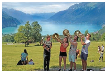
The BPYO Horns perform in Interlaken, Switzerland

The tour also featured cultural exchanges with young Swiss musicians, hiking in the beautiful Swiss Alps, visits to the homes of some of classical music's greatest composers, and a concert of the Berlin Philharmonic featuring a meet and greet with renowned conductor Sir Simon Rattle. 🇨🇭