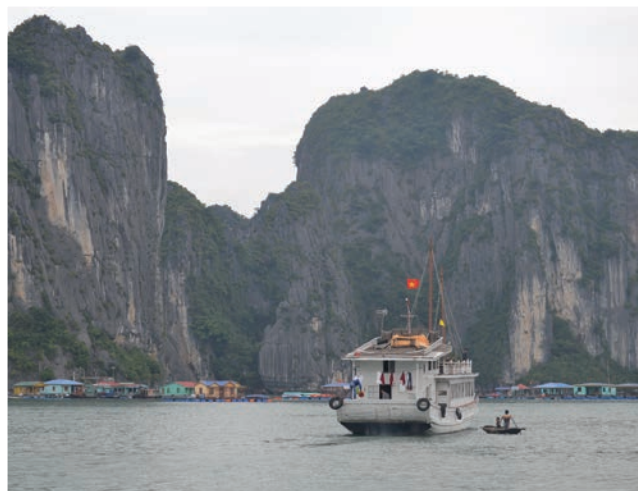
Credit Ha Long Bay

through Da Nang , Hoi An , Ho Chi Minh City , and Hanoi , the choir experienced some of Vietnam's more historic cities, as well as its hectic and bustling modern metropolises. The choir joined with a local Vietnamese children's choir in what came to be called an Australian Friendship Concert. 🐼