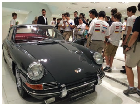
◀ Pacific Boychoir enjoys a visit to the Porsche Museum while on tour in Germany