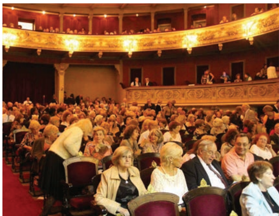
Audience waits in anticipation for Morgan State at the Teatro Circular in Rosario

The New York Youth Symphony Orchestra, New York City's premier youth orchestra, toured Argentina this summer – the ensemble's first-ever international tour in its 52-year history. In every concert, they were cheered by warm and enthusiastic audiences and experienced sold out venues, performing for thousands.