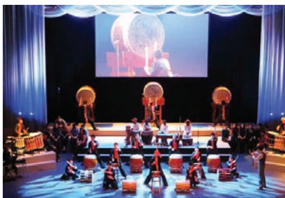
Vassar College Choir performs with Japanese and Ugandan students from the Ashinaga Foundation