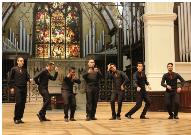
Camerata Vocale Sine Nomine performs for audiences at the Church of the Epiphany in Washington, D.C.