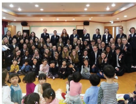
WCC donates time to outreach at an orphanage

In addition to sightseeing in Seoul, including observing a traditional Changing of the Guard ceremony at Gyeongbokgung Palace, the ensemble visited a traditional Korean folk village, and participated in a traditional tea ceremony in a Korean temple. The choir also enjoyed two outreach concerts at a girls' high school and a local orphanage. 🐼