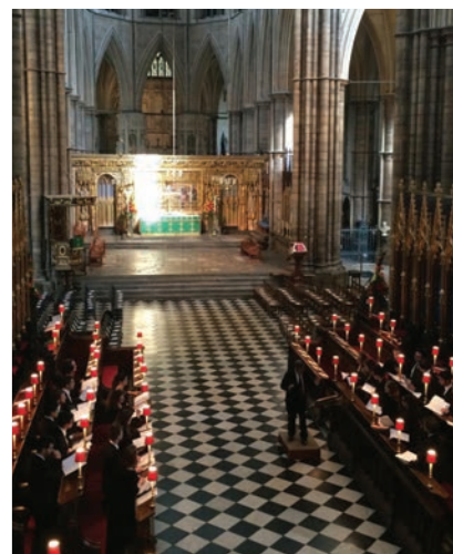
Yale Schola Cantorum prepares to sing Evensong at Westminster Abbey ▶