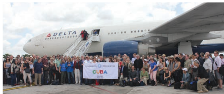
The Minnesota Orchestra arrives in Cuba

tour for a major professional orchestra are multiplied tenfold. With our eighteen years of experience in Cuba, though, Classical Movements was uniquely equipped to enable many firsts, including getting permission for the first ever entire concert broadcast live from Cuba. From obtaining visas and performance permissions, to finding and reserving venues, and flying more than 160 people and their valuable instruments on the largest passenger plane to ever fly direct from the U.S. to Cuba, preparation was only the beginning.