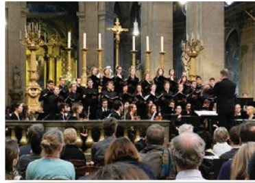
Yale Schola Cantorum and Juilliard415 perform together in Paris

The ensembles formed lasting connections with fellow students, musicians, and their welcoming hosts. With a full itinerary of concerts from Choral Evensong services to performing new commissions , the ensembles