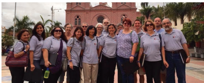
▶ Coral Cantigas Oct 2014 in Colombia