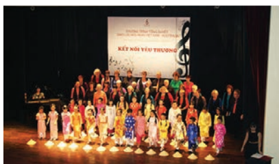
Vocal Fusion participates in an exchange concert with a local children's choir in Vietnam

H ailing from Australia, Vocal Fusion Choir traveled to Vietnam for their tour this year, where they performed to warm welcomes from enthusiastic audiences. Touring