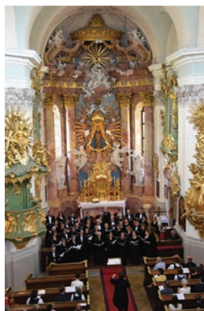
◀ Capitol Hill Chorale performs during Rhapsody! 2015

The 2015 Rhapsody! International Choral Festival, held in Austria and the Czech Republic annually in July, this year featured choirs from Zimbabwe, Austria, the Czech Republic, Canada, Australia, and the United States. From Austrian and Czech music workshops, to beautiful concerts with enthusiastic audiences, choral musicians and patrons alike enjoyed an incredible musical experience across Austria and the Czech Republic. From walking tours to discover the city centers of Salzburg, Vienna, and Prague, to singing dinners where participants regaled each other with song, Rhapsody! participants reveled in the vibrancy of these centers of culture.