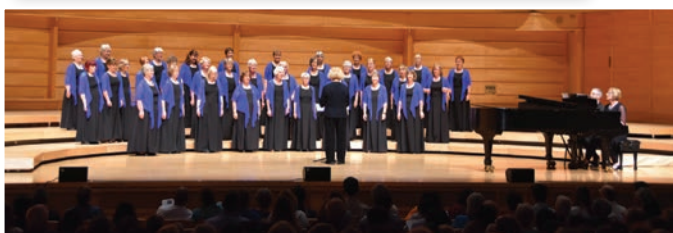
▶ Australian vocal group Women of Note perform at Strathmore Hall in Bethesda, MD during the Serenade! Festival