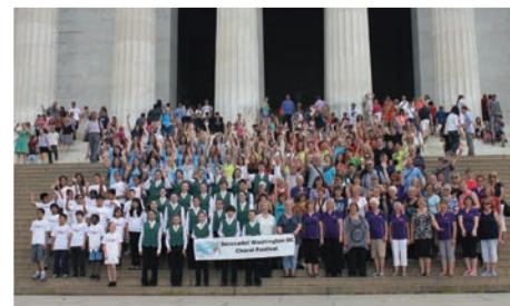
Serenade! Festival choirs gather on the steps of the Lincoln Memorial