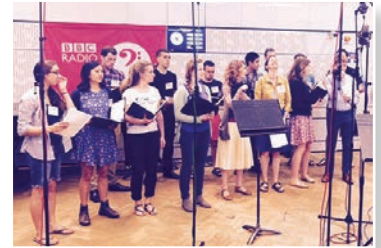
The collective ensemble performs as guests on BBC's Radio 3

on BBC's Radio 3 , including once as a guest on the popular afternoon program "In Tune," before finishing their tour together in Paris . 🎵