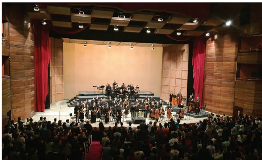
The New York Youth Symphony receives a standing ovation in Buenos Aires