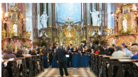
Miami Children's Chorus performs in Prague