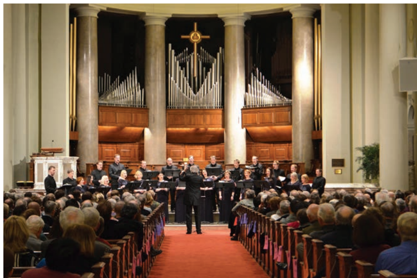
The Estonian Philharmonic Chamber Choir performs in Washington, D.C.