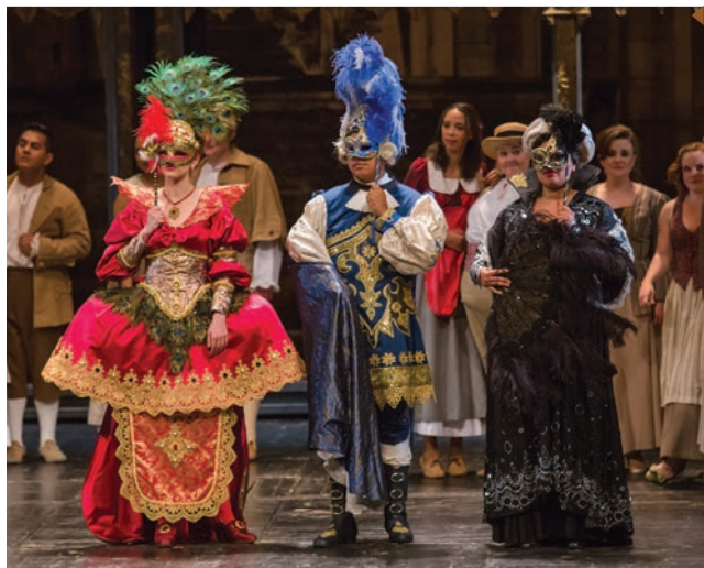
◀ Scenes from Don Giovanni at the Estates Theater