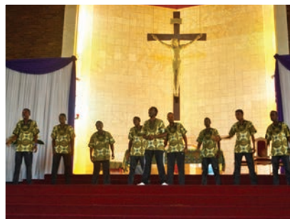
The Impumelelo Shining Stars perform in Soweto

opportunities ; Soul Sounds of Sri Lanka spent a portion of Mandela Day at the Steve Biko Academic Hospital in Pretoria, singing for young cancer patients. As the largest international choral gathering in South Africa , Ihlombe! continues to serve as a cultural gathering place, bringing diverse groups together through the power of music. 🎶