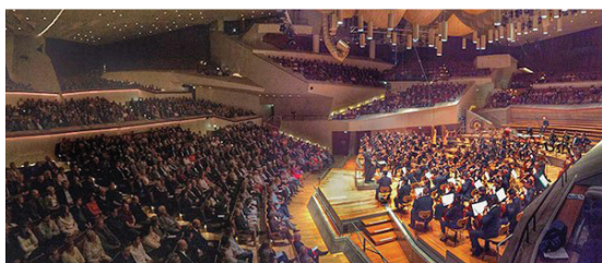
Full house at Berlin Philharmonic