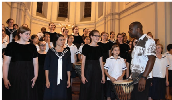
◀ Singers from Partners in Praise Girls Choir, Insingizi, and Vancouver Children's Choir have some fun during the Rhapsody! Festival