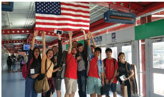
GDYO members get excited about their tour to China