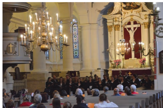
GWU Singers perform in Latvia alongside collaborators Latvian Voices

Choristers took advantage of the opportunity to learn firsthand about the region's rich history, as well as gain an appreciation for their religious traditions through their visits to and performances in local cathedrals. 🙏