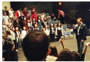
The Trinity University Chamber Singers participate in a workshop in Beverly Hills

Based in Texas, the Trinity University Chamber Singers under