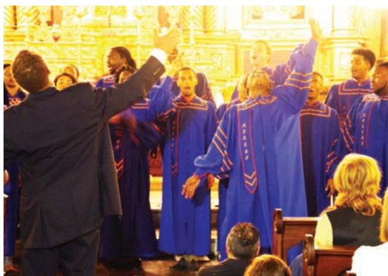
The Morgan State University Choir introduced Argentinian audiences to different styles of American music through their lively performances