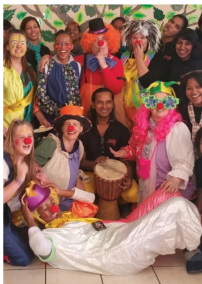
Soul Sounds cheers young cancer patients at the Steve Biko Academic Hospital in Pretoria

In addition to collaborations , participating choirs had the opportunity to engage in choral workshops with prestigious conductors, learning and improving their own craft. Choirs also enjoyed outreach