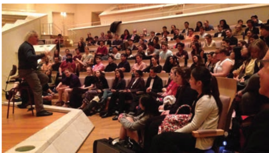
Sir Simon Rattle addresses BPYO students