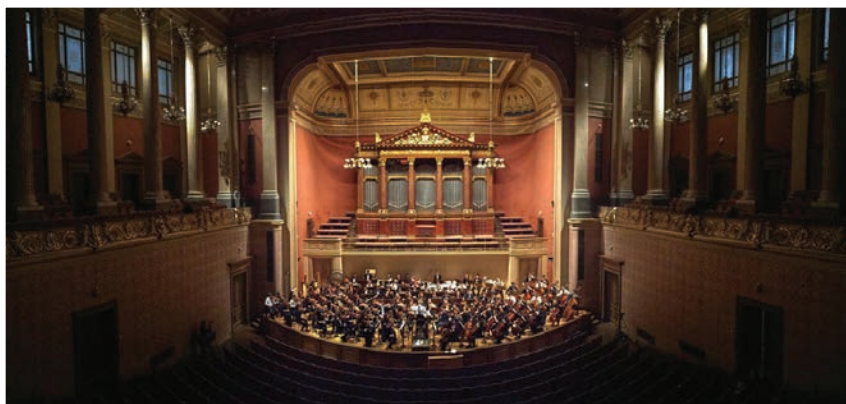
Boston Philharmonic Youth Orchestra prepares for their concert in Dvorak Hall in Prague