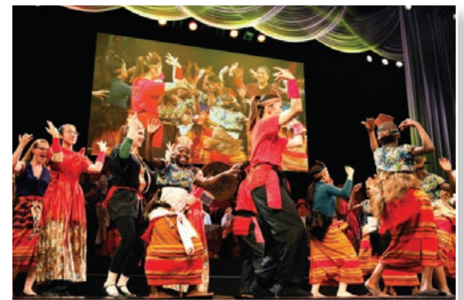
Ugandan children join in the festivities during At Home in the World, photo: Ashinaga Foundation

This year's performance marked a continuation of the event's successful 2014 debut in Japan. 🎵