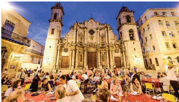
◀ Minnesota Orchestra enjoys an al fresco Cuban meal outside the Havana Cathedral in Cuba