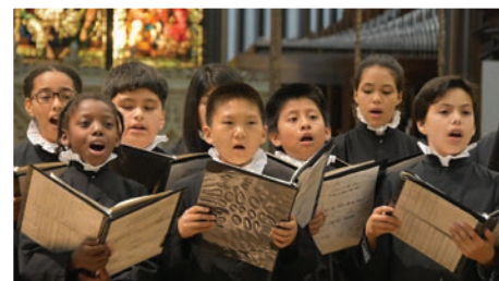
Members of the Transfiguration Choir of Boys and Girls