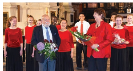
Krzysztof Penderecki with the Toronto Children's Chorus in Penderecki's native Poland

Choristers took advantage of the opportunity to learn firsthand about the region's rich history, as well as gain an appreciation for their religious traditions through their visits to and performances in local cathedrals. 🙏