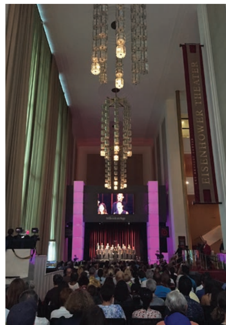
Coro Entrevoques performs at the Kennedy Center's Millennium Stage in Washington, D.C.

addition to performing in the Serenade! Washington, D.C. Choral Festival, while Camerata Vocale Sine Nomine traveled extensively throughout the U.S. during their month-long tour, with stops in Maryland, Pennsylvania, Connecticut, Washington, D.C., Utah, Tennessee, and North Carolina. 🇨🇺