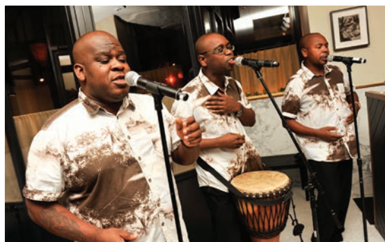
Insingizi performs in New York