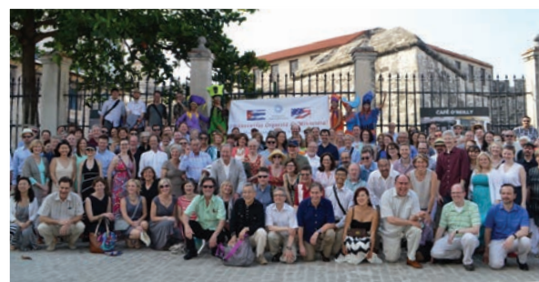
Cuban street performers welcome the Orchestra to Havana

of diplomatic relations between the US and Cuba, speaks volumes about the power of cultural diplomacy through music. 🍷