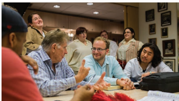
▶ Stage director Sherrill Milnes meets with the cast and crew of Don Giovanni during the Prague Summer Nights Festival