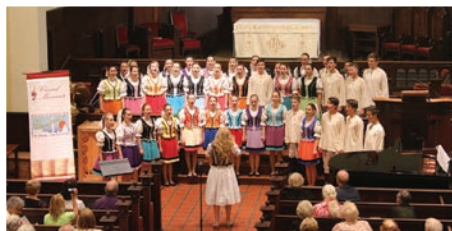
Pro Musica-Magnolia of Slovakia