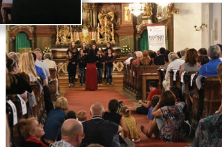
▶ Superar performs in Vienna