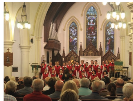
The Los Angeles Children's Chorus performs at All Saints Episcopal Church