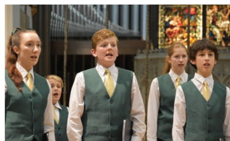
Members of the Australia Children's Chorus perform at the Church of the Epiphany

◀ The massed Serenade! Festival choir rehearses under the direction of Doreen Rao