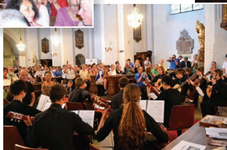
▶ Churchlands School of Music performs in Vienna