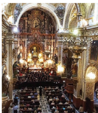
The University of Kentucky Women's Choir performs in Granada