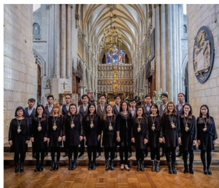
Dolce Voce prepares to perform in Southwark cathedral.

Audiences adored the ensemble's performances, with capacity crowds in Scotland and London. The choir had an opportunity to perform