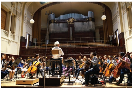
BPYO rehearses with legendary cellist Natalia Gutman in Prague's Smetana Hall

"The concert is already so full of energy that many a professional ensemble should go pale with envy."