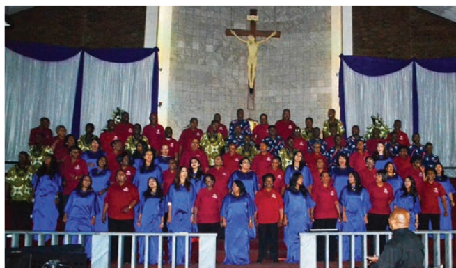
Ihloambe! Choirs perform together in Soweto

opportunities ; Soul Sounds of Sri Lanka spent a portion of Mandela Day at the Steve Biko Academic Hospital in Pretoria, singing for young cancer patients. As the largest international choral gathering in South Africa , Ihlombe! continues to serve as a cultural gathering place, bringing diverse groups together through the power of music. 🎶