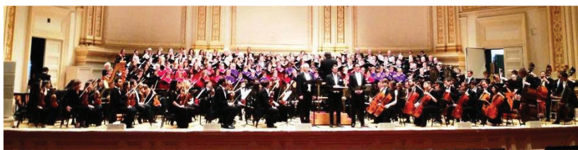
The Washington Chorus performs a dress rehearsal in Carnegie Hall