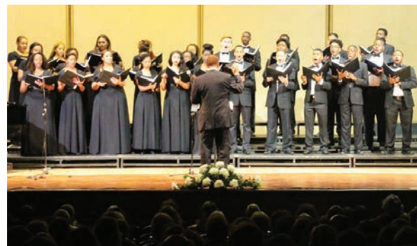
The Morgan State University Choir performs to a large audience in Rosario