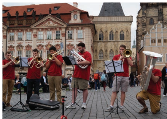
▶ Members of the Boston Philharmonic Youth Orchestra present an impromptu performance for passersby in Prague