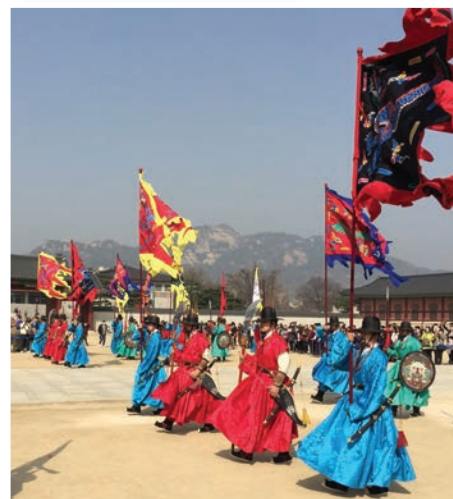
WCC visits a Folk Village in Korea