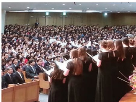
Wellesley College Choir performs in front of thousands at MyungSung Presbyterian Church in Seoul