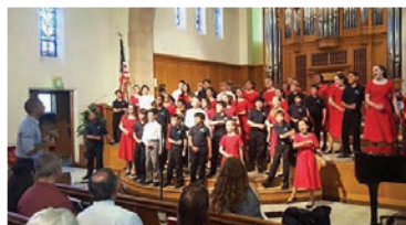
The Junior Varsity Troubadours of Pacific Boychoir perform with the Colorado Springs Children's Choir