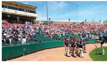
Pacific Boychoir sings the National Anthem at a Colorado Springs Skysox baseball game