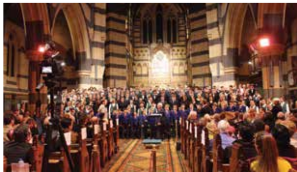
Collaborative concert in Melbourne's St. Paul's Cathedral