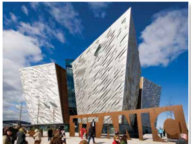
Harland & Wolff shipyard, where the RMS Titanic was built