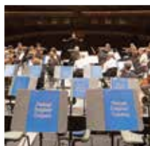
Eschenbach, NSO rehearsal at Teatr Wielki in Warsaw

For the NSO's wildly successful tour of Europe, maestro Eschenbach paired grand Germans like Beethoven, Brahms (via Schoenberg), Wagner, Weber and Schubert with such modern