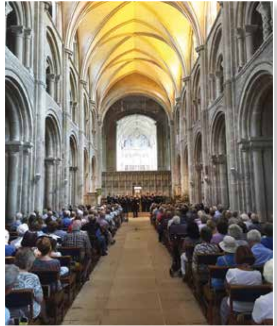
Packed lunchtime concert in the seaside town of Christchurch