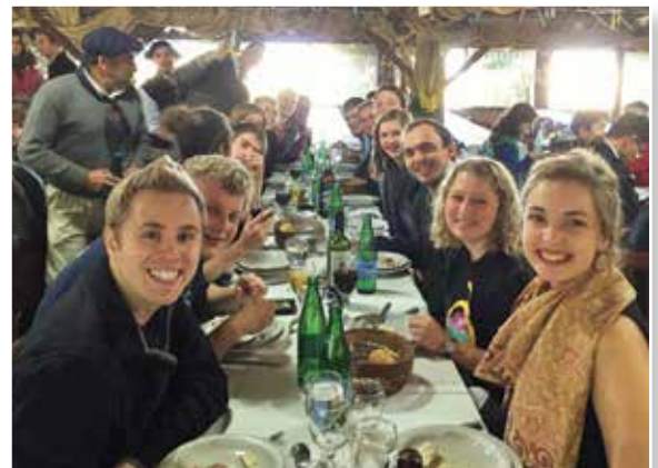
▶ Dinner at the gaucho ranch