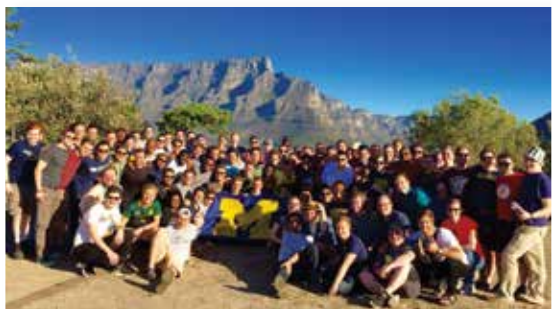
Michigan at Signal Hill in Cape Town