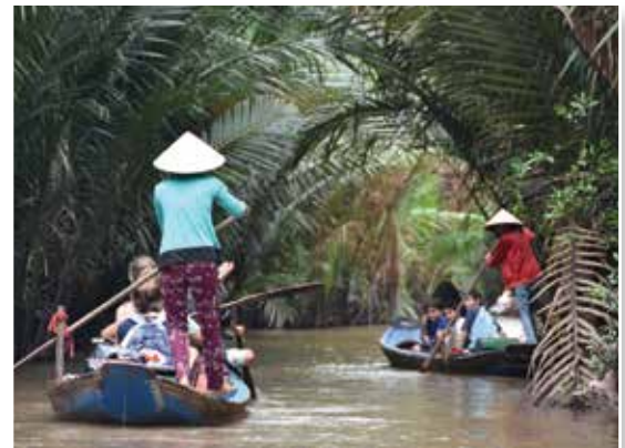
Sailing down the Mekong Delta

YAC distributed these trinkets and toys during a heartwarming visit to the Vietnam Friendship Village , just outside of Hanoi. 🍵