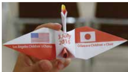
Paper crane, in honor of the Los Angeles Children's Chorus' Japanese tour