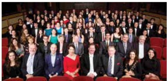
Prague Summer Nights: Class of 2016