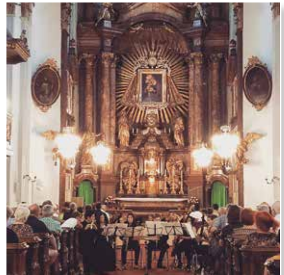
Sold-out CYO chamber performance in a Viennese church

In Salzburg, the kids from California had a unique opportunity to collaborate with choirs, performing together at the Mozarteum and Salzburg Cathedral , as well as a sold-out concert in one of Vienna's majestic