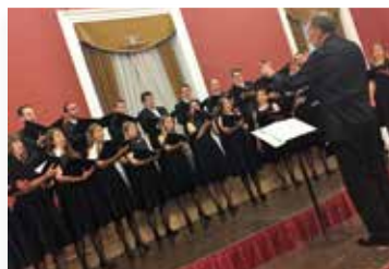
Swiss choir, Lithuanian capital (Vilnius), international program

and in two gorgeous Polish churches— Warsaw's Holy Cross , where Chopin's heart is interred, and St. Bernardine in Kraków —audiences thoroughly appreciated their studied takes on Purcell, Debussy and Poulenc, as well as African-