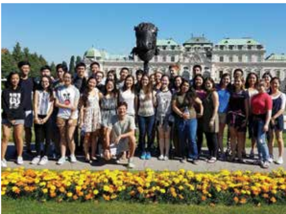
Colburn Youth in front of Belvedere Palace