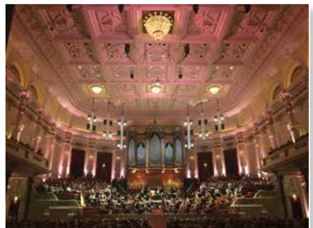
Minnesota Orchestra, Osmo Vänskä at the iconic Concertgebouw in Amsterdam