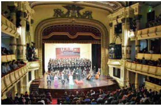
YAC performs inside Hanoi Opera House

For YAC’s Southeast Asia tour, Classical Movements collected necklaces and toys through our Vietnam Necklace Project , intent on giving them away to that country’s disabled children, including some suffering the effects of Agent Orange . CM and