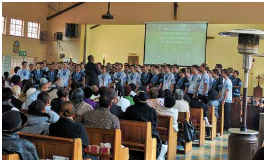
UMMGC perform at Holy Cross Church in Soweto, South Africa