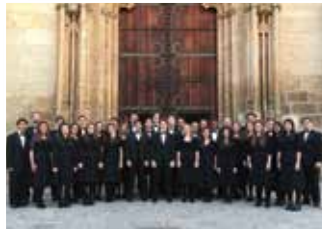
DCGC at Parroquia de Santa Teresa y Santa Isabel