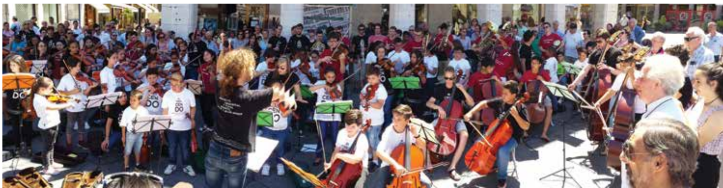
Outside with In Crescendo