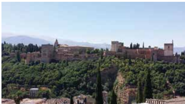
Alhambra, UNESCO World Heritage Site, in Granada

After Zander's BPYO conducting masterclass at the Barcelona Conservatory , their Tchaikovsky and Debussy traveled south to the Granada Festival , one of Europe's most prestigious music festivals. Maestro and orchestra then performed an outreach concert, featuring Beethoven's Eroica Symphony , in the small Andalusian town of Huescar —quite the meaningful event, indeed, as the BPYO was the first orchestra to ever play that town! Moving north to the city of Valladolid , Zander and band not only performed another wildly successful concert, but also