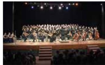
Full house, full stage at Teatro Nacional in Havana