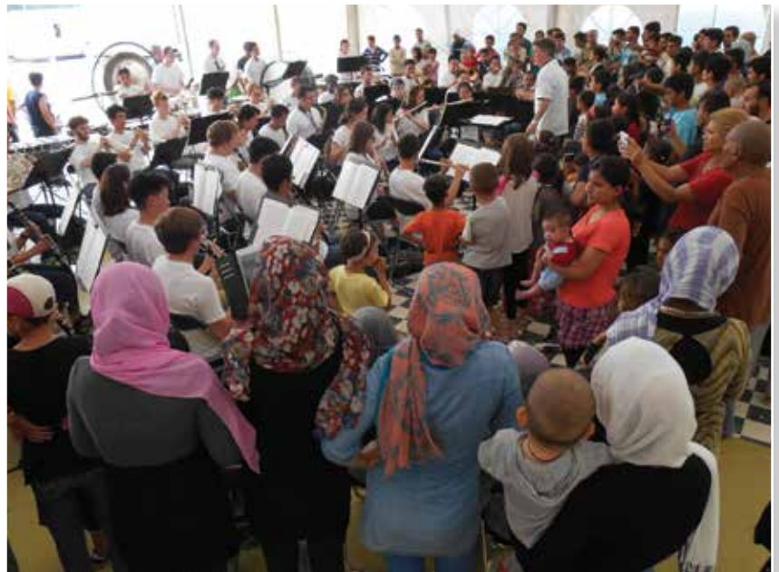
Women and their children listen to YCB at Eleonas Refugee Camp

"Yale Concert Band was genuinely grateful for the opportunity to perform exciting, contemplative, exuberant and spiritually uplifting music for audiences throughout Greece. Committed to bringing its music to all people, we were humbled to perform at Eleonas in Athens. We hope that our music helped to drown out the sounds of a world gone mad with war."