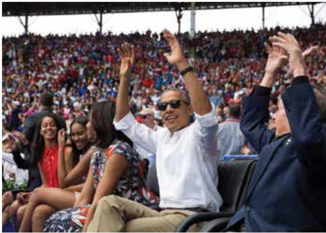
First daughters Malia, Sasha laugh with First Lady Michelle, as American President Barack Obama and Cuban President Raúl Castro do “the wave,” after CM collaborator Coro Nacional de Cuba performed the U.S. National Anthem