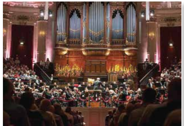
Minnesota fills up the Concertgebouw

As always, maestro Vänskä made time for outreach; this time via a side-by-side rehearsal with VIVO, a youth orchestra comprised of musicians from across Finland. 🇫🇮