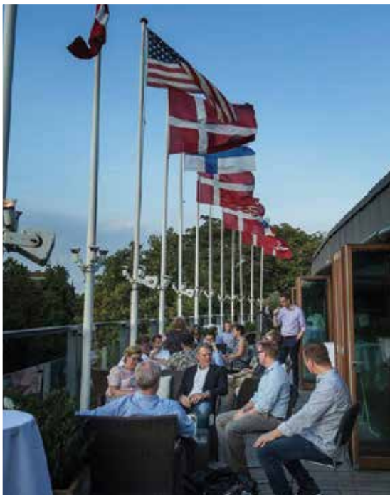
Orchestra members relax in Copenhagen's famous Tivoli Gardens

"The match here has always been thrilling—the conductor's dynamism on the podium plus the powerful engine of this band—and now there seems something irrepressibly triumphant about it."