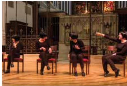
◀ Kobra Ensemble (Netherlands) performs a unique musical theater piece