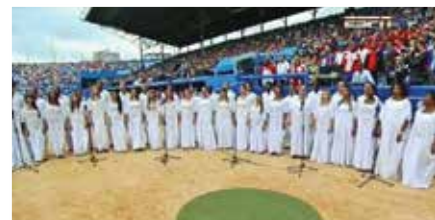
CNC sings for Castro and Obama

Spangled Banner." The CNC then went on to perform America's anthem at the historic Cuban-American baseball game, attended by both Cuban President Raúl Castro and U.S. President Barack Obama and his family. (The Tampa Bay Rays defeated the Cuban National Team, 4-1.) 🎶