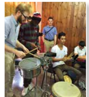
Giving the drummers some, indeed

Cuban people and their many extraordinary cultural traditions. 🍷