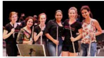
Bard's flute section pose with their Cuban counterparts

During the first week of June, the orchestra of the top-notch Bard College Conservatory of Music filled halls in Cienfuegos, Santa Clara and Havana, Cuba. With conductor, author and Bard President Leon Botstein behind the podium, soloist Peter Serkin on the piano bench, the ensemble from Annandale-on-Hudson, New York received a standing, Cuban ovation after nearly every piece. The highlight,