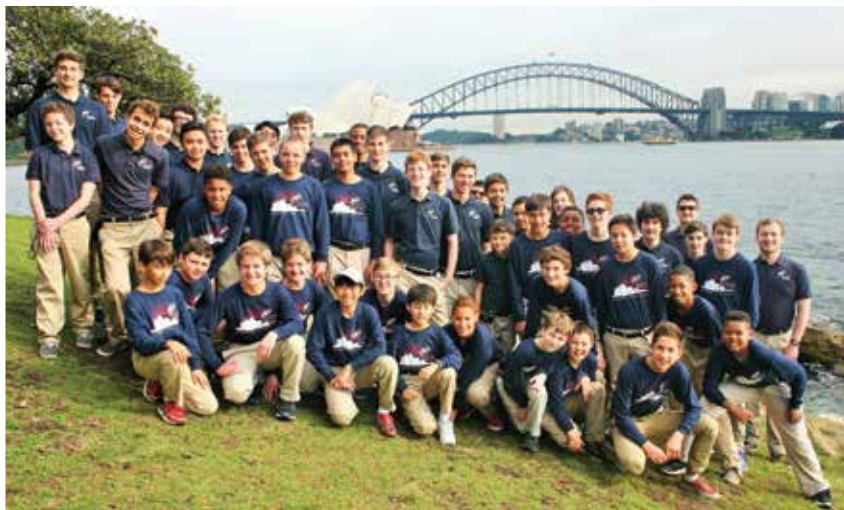
Pacific Boys at Sydney Harbor, with the Sydney Opera House

The final stop of the Pacific Boychoir began in the truly bustling metropolis of Sydney with a bittersweet harbor tour, replete with stunning views of the iconic Sydney Opera House . Once again, PBC performed another joint concert—this time, at the Sydney Conservatorium of Music —and offered an informative, sitting-room-only workshop at a local music camp. Conductor and choir celebrated their very last day in Australia at the beach, up-close-and-personal with kangaroos and koalas, wombats and wallabies. 🐨