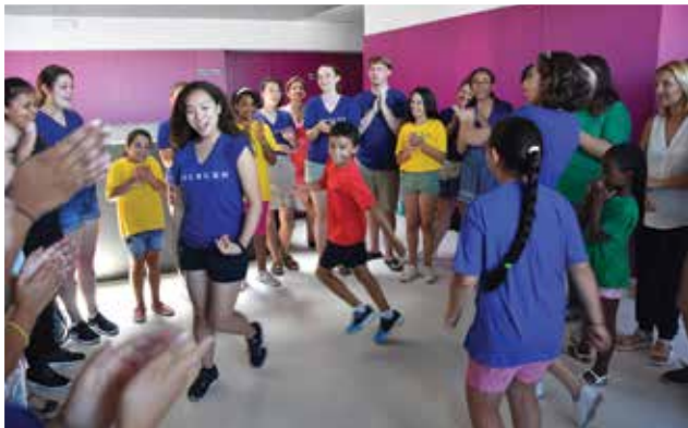
Colburn Children’s Choir of Los Angeles sing a round, literally, with the children of Seville’s Coro Meridianos