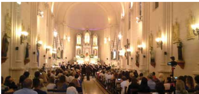
UVA Glee at a beautiful Buenos Aires cathedral