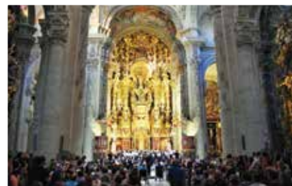
Standing room and cell phones at Iglesia del Salvador

Accompanied by local Spanish orchestras, Lexington's 60 singers delighted all with pitch-