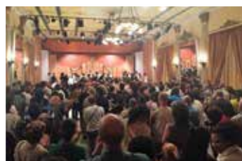
Are you ready, Matanzas?

Another ensemble from Minnesota's St. Olaf College , known around the world for its music program, traveled with Classical Movements this year—the Jazz Band , touring to Cuba, in March. Naturally, this improv group relished every opportunity to immerse themselves in the local scene, taking part in several pre-arranged collaborative rehearsals and concerts, but often