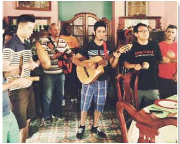
Members of the Bard Conservatory Orchestra from New York jam with the locals in Havana