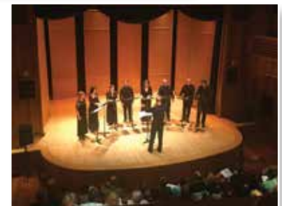
Ensemble Musicaficta (Italy) at the Maazel’s Castleton Festival

This year’s Serenade! best-of, grand finale took place at the Music Center at Strathmore , highlighted by a stunning, spontaneous performance of Rachmaninoff’s Bogoróditse Dyévo , which brought the audience to silence, then to its feet. 🐣