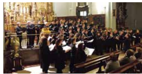
DCGC in St. Justus & St. Pastor in Alcalá de Henares

exchanges with the choir of Universidad Autónoma de Madrid enriched that action, culminating in a side-by-side concert inside one of central Madrid's flagship churches, Parroquia de Santa Teresa y Santa Isabel . 🍷