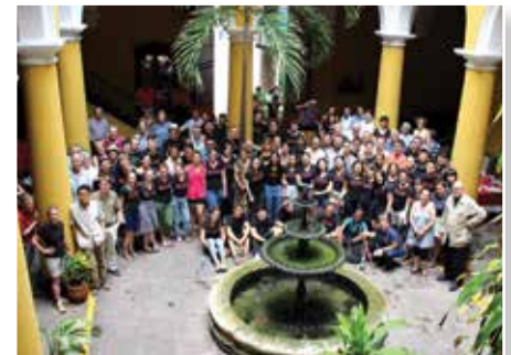
Leon Botstein, Bard Conservatory Orchestra celebrate the end of a successful tour in Old Havana

organized a record 11 separate Cuban tours during our 2016 season, including for a top conservatory orchestra, five renowned choirs and even a hard-groovin’ jazz band. 🎷