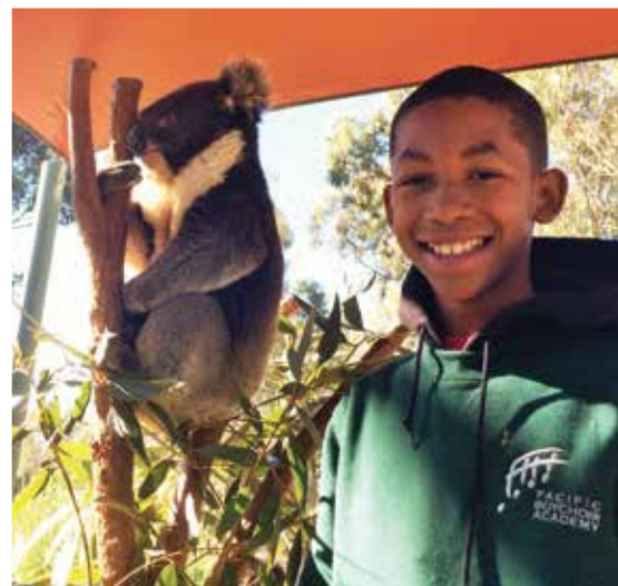
Look, a koala!

migrant children. Next? Canberra, the capital, a much busier place full of museums, schools and especially concert halls, all with panoramic views. Collaborative concerts are a staple of every tour Classical Movements