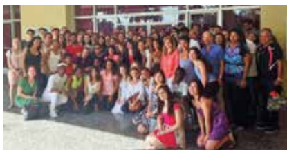
Vassar with their new ISA friends