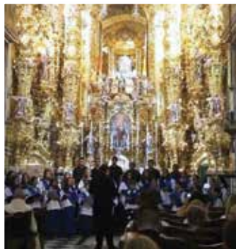
Collaborative concert at Granada's stunning Iglesia de San Juan de Dios