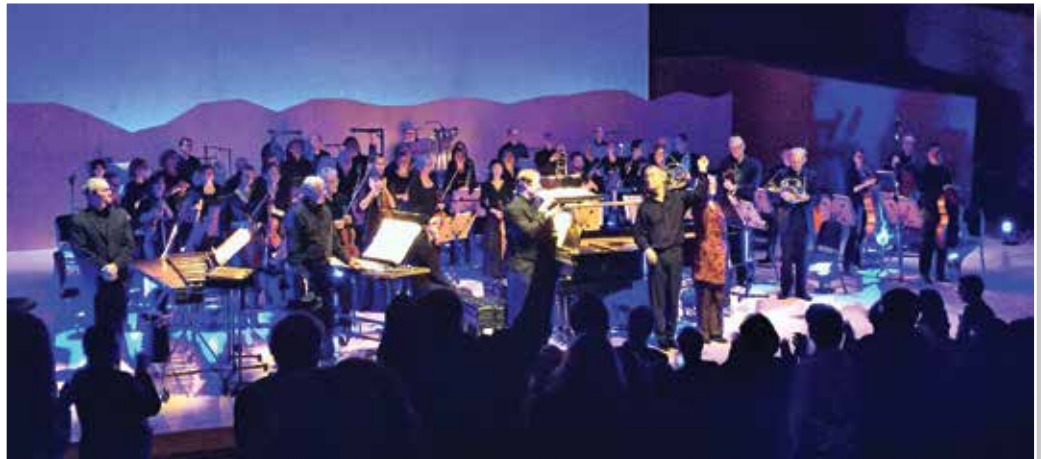
SLSO's Messiaenic curtain call at Disney Hall in L.A.