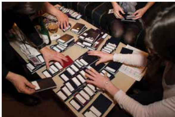
National Symphony (D.C.) staff sort through the orchestra's many passports in Berlin