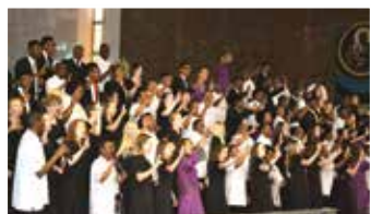
Combined Ihloambe! 2016 choirs perform together in Soweto

won the top spot in the Adult Choir category.