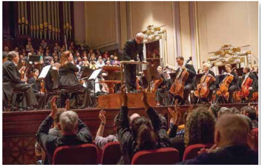
Vänskä takes a bow at Edinburgh's Usher Hall

or maybe even better." With dramatic programming heavy on symphonies (Beethoven's Third and Fifth , Dvořák's Ninth ) and violin concerti (Prokofiev's First , Sibelius' only), well cared-for by fellow Finn Pekka Kuusisto, orchestra and soloist played to packed venues like Sibelius Hall in Vänskä's old home of Lahti, Usher Hall as part of the Edinburgh International Festival, Amsterdam's glorious Concertgebouw and Tivoli Hall for their Copenhagen debut. For an encore in Edinburgh, Vänskä spoke of the lockout and the global refugee crisis, then grabbed his clarinet to duet with Kuusisto on melancholy Swedish folk tune, creating a poignant moment for everyone present.