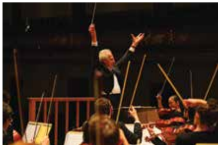
Zander, BPYO finish strong

It was a rocky start, though. When Air Europa canceled the flight out of John F. Kennedy International Airport that was supposed to have 55 of the 125 BPYO musicians (and their instruments) on it, Classical Movements swooped in to get every last stranded string in their sold-out performance seat before Zander's downbeat that night in Terrassa . Up in the air, the video of anxious youths performing "Nimrod" from Elgar's Enigma Variations that CM posted from the terminal had gone viral.