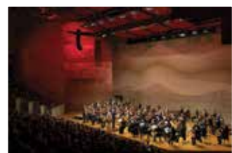
Maestro Eschenbach leads NSO in Regensburg