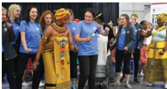
Canada, meet South Africa