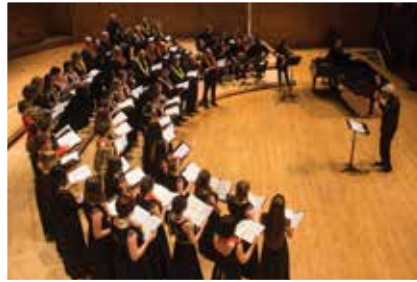
Combined choirs of the 2016 Serenade! Festival