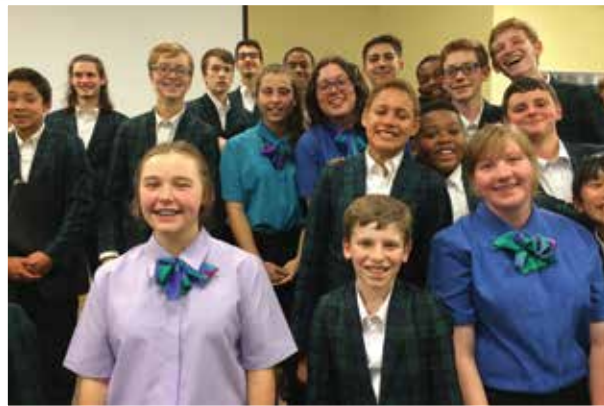
Pacific Boychoir of San Francisco pose with Canberra, Australia’s Woden Valley Youth Choir