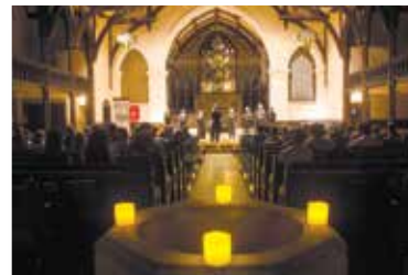
◀ First-ever Midnight Serenade! at Church of the Epiphany