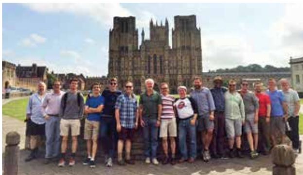
Men of San Francisco’s Grace Cathedral Choir snap a pic in front of Wells Cathedral in England