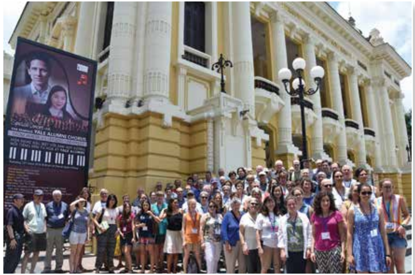
YAC out front of Hanoi Opera House