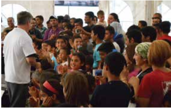
Afghan and Syrian audience reacts to Duffy, YCB's performance

Since the founding of the company in 1992, Classical Movements has used the universal language of music to reach beyond borders, working tirelessly to share that powerful ability to provide healing, even transformative experiences for people in 145 countries all across the world.