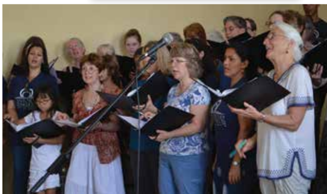
California's Cabrillo Symphonic Chorus sing side-by-side with Coro Cantores de Cienfuegos in Cuba