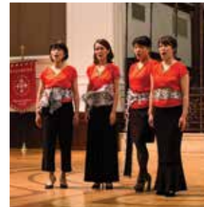
◀ Four talented ladies of Ensemble Planeta (Japan)