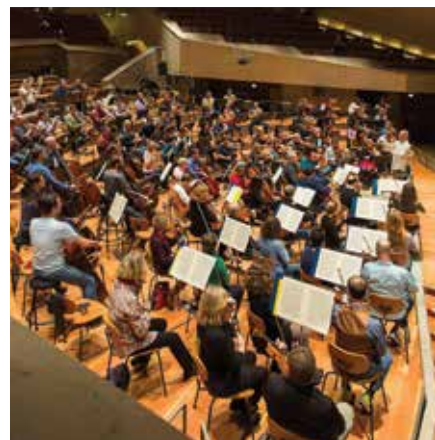
Eschenbach rehearses NSO in Berlin Philharmonie

Dvořák Cello Concerto in Oviedo, Regensburg, the cellist's hometown of Munich and Warsaw. Chinese superstar Lang Lang conjured up a scorching Grieg Piano Concerto in Vienna, Düsseldorf, Hamburg, Berlin, Luxembourg City and Wrocław, where Eschenbach, native son of "Breslau," was honored with a signature plaque outside the city's brand-new Narodowe Forum Muzyki , just two days shy of his 76 th birthday. 🎶