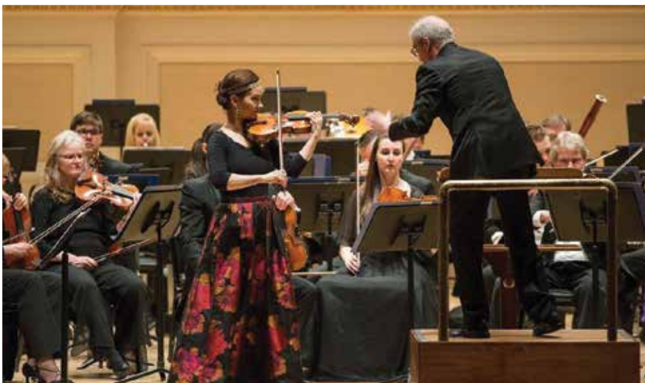
Hilary Hahn performs Sibelius at Carnegie Hall with Osmo Vänskä, Minnesota Orchestra