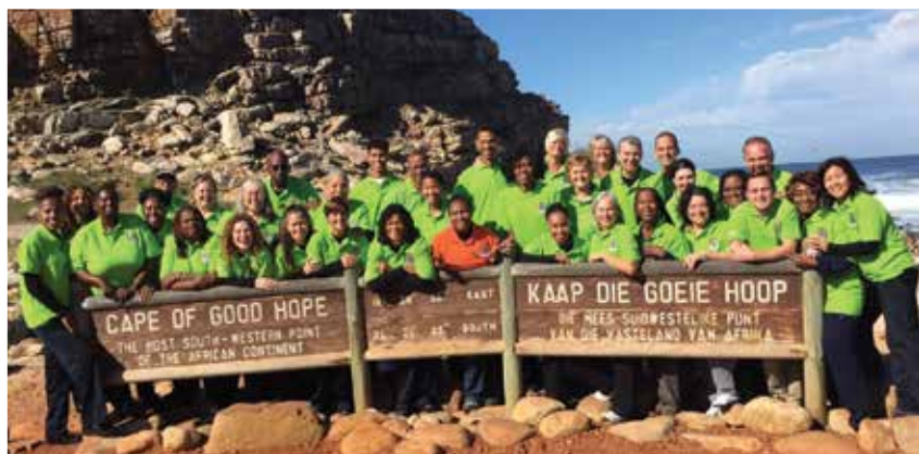
S.T.A.R.S. of Motown shine southwesterly at the Cape of Good Hope