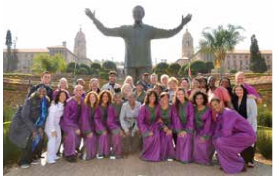
Seeing S.T.A.R.S. on Nelson Mandela Square in Pretoria

As always, each one of this year's 11 choirs presented a thorough tasting of their own unique repertoire and choral traditions, making Ihloambe! 2016 a true celebration of diversity. In addition to all the many collaborative opportunities, participating choirs engaged in immersive workshops with prestigious conductors, helping to hone their choral craft. Of course, Ihloambe! choirs enjoyed various outreach projects, as well. Youth winners MHCGC visited a local orphanage; the adults of VDME spent time with an after-school choral program focused on impoverished kids.