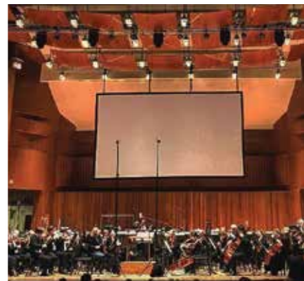
BSO premieres Christopher Rouse's Processional at Meyerhoff Symphony Hall

Pulitzer recipient Caroline Shaw and the multi-Grammy-winning Joan Tower , penning her sixth Fanfare for the Uncommon Woman .