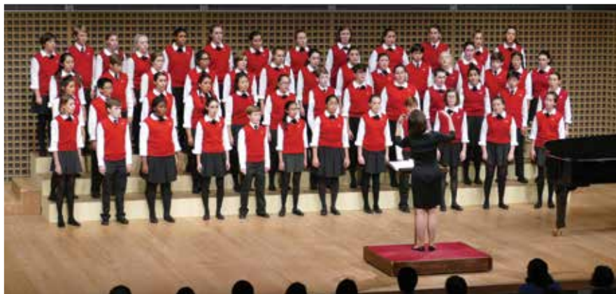
Full house at Kyoto Concert Hall