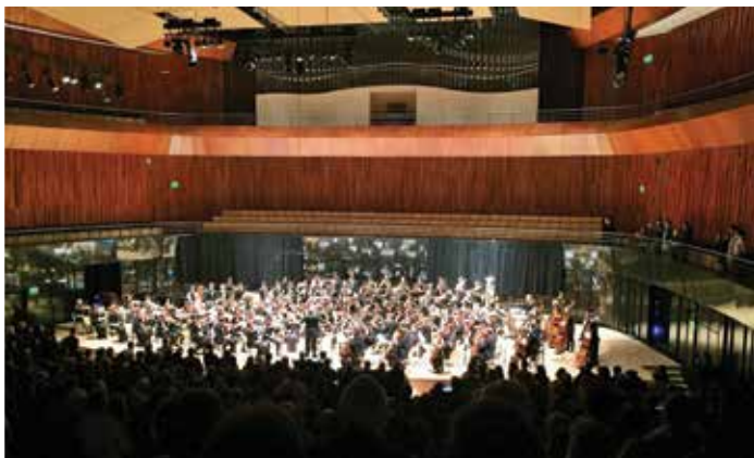
◀ Full house at Kirchner Centre in Buenos Aires