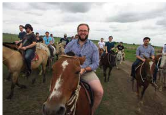
Cavaliers, on horseback, at an Argentinian gaucho ranch