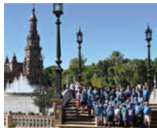
Lexington, KY's finest in Seville's Plaza de España

perfect renditions of Fauré's Requiem , along with similarly well-rehearsed selections from their wide repertoire of both European and American music. Tour highlights included rave performances in Madrid's open-air amphitheater at Palacio Boadilla del Monte , the visually and acoustically stunning Segovia Cathedral , as well as several joyous walking tours through the winding streets of Seville . 🍷