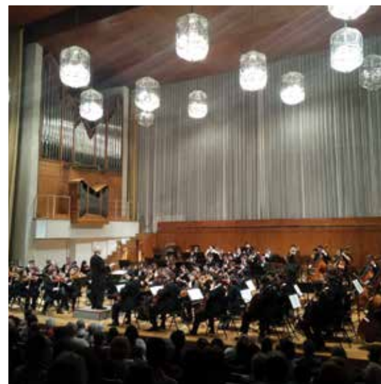
Rapt audience at Granada's Auditorio Nacional Manuel de Falla

The tour's last concerts found the Bostonians in the Spanish capital of Madrid , at the magnificent