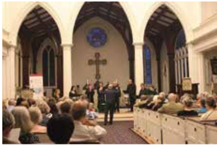
The opening concert at Serenade! 2016 at St. Thomas Church Old Town

Serenade!, Washington's finest choral festival, turned 6 years old in June, reaching an important milestone: 50 choirs hosted from around the world since its founding in 2011. Featuring incredible ensembles from Latvia, Japan, Netherlands, South Korea, Italy and the United States, this summer's guest conductor was