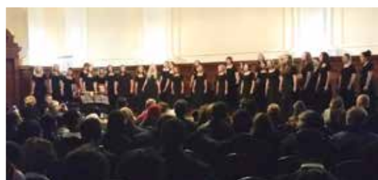
Award-winning MHCGC in concert

Almost a decade later, CM's Ihloambe! South African Choral Festival remains a cultural touchstone for the continent's Rainbow Nation, bringing a plurality of peoples together through the power of music. 🎵