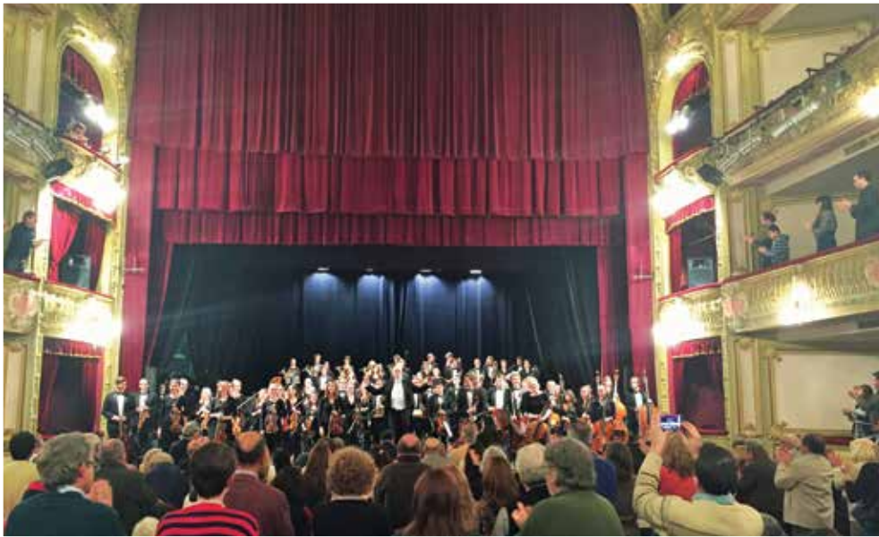
Standing ovation for Minnesota’s mighty St. Olaf Lions