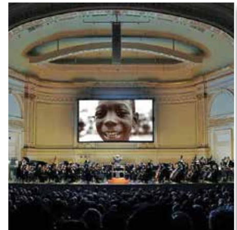
Marin Alsop leads Baltimore Symphony in Kevin Puts' The City