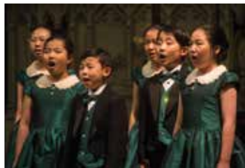
◀ FEBC Busan Children’s Choir (South Korean) at Church of the Epiphany