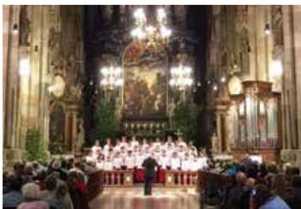
TBC performs a concert in Vienna