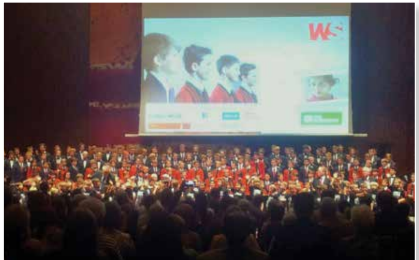
TBC and WS, helping raise €12,000 for refugee children

The Texas Boys Choir also presented concerts in Potsdam, Leipzig, and Vienna 🇺🇸