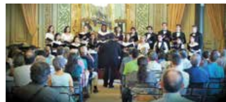
Despite competition from the European Championship finals (Portugal won!), full house for Lisbon's Palácio da Ajuda

matinee concert in Lisbon , highlights of the tour included workshops with receptive local choruses in Seville , Granada and Madrid . Perhaps the most successful of these was in Seville , where CCC's full day with a local children's chorus started off with some sightseeing, broke briefly for a delicious group lunch and ended with a well-attended performance—all covered by Sevillanos print and digital media. 🍷