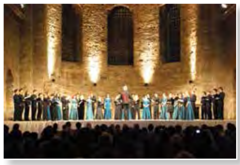
The Yale Institute of Sacred Music wows the crowd in Aya Irini in Istanbul, Turkey.

Classical Movements was thrilled to be working with the Yale Institute of Sacred Music for the second time, having last worked with them in 2011 for a collaborative concert tour with Juilliard Historical