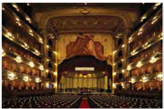
Argentina's prestigious Teatro Colon, as seen above, was just one of the great venues performed at during the Tour of the Americas.