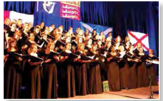
The University of Kentucky Women's Choir performs at the Steam Engine Museum in England.

The University of Kentucky Women's Choir toured the United Kingdom and Ireland this past June, where they sang in formal solo and collaborative concerts. One particularly interesting performance was a joint concert with a local choir at England's Steam Engine