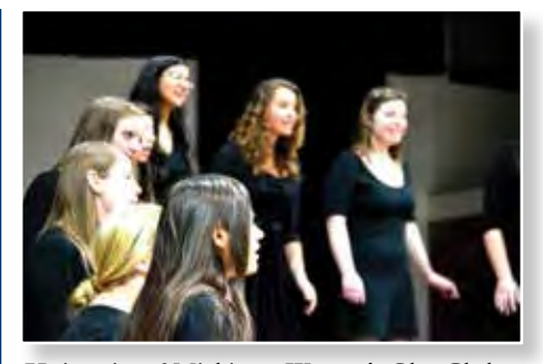
University of Michigan Women's Glee Club sings to audiences in Kensington.

participating in outreach events, such as singing at and assisting a