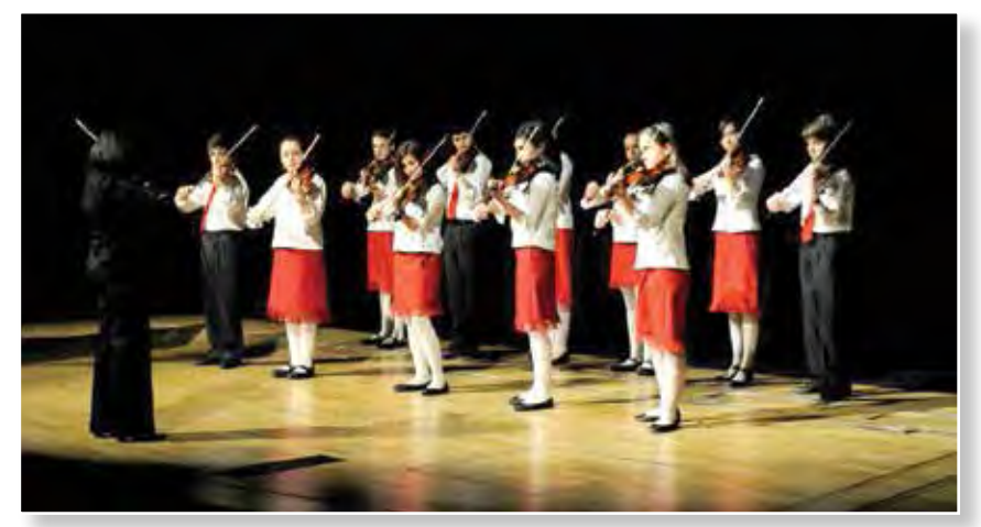
Young members of Os Violinhos, from Portugal, perform in the Lappia House in Rovaniemi, Finland.

While in Finland, Os Violinhos made two excellent performances, with the first being at the famous "Rock Church" in Helsinki followed by a performance in Rovaniemi at the Lappia Hall as part of Rovaniemi Design Week. Both concerts were very well-attended and appreciated by all. During their concert tour, the ensemble had the opportunity to visit a reindeer farm and