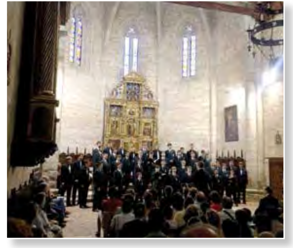
The gorgeous voices of the Pacific Boychoir resonate in the Monasterio de Santa Clara in Astudillo, Spain.

before ending with two final concerts in beautiful Barcelona. While on tour, the boys were fortunate to be in Spain during the Running of the Bulls in Pamploma, where they watched the running and visited the Bull Running Museum .