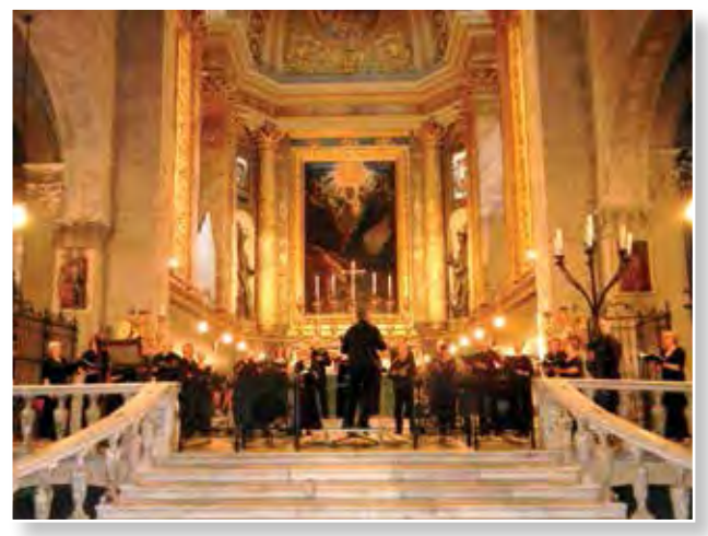
In Pistoia, Market Square Singers perform a collaborative concert in a glorious cathedral.

With concerts in Assisi, Pistoia, Florence, and Lucca, the choir also had time to visit and explore Rome, Spoleto,