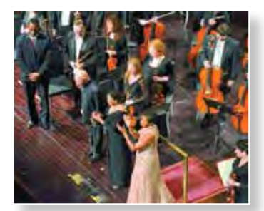
National Symphony Orchestra performing in Trinidad and Tobago

Some highlighted concerts included the Teatro Colón, a venue considered by many to be one of the most beautiful in the world, as well as the legendary Teatro Municipal in Rio de Janeiro and Teatro Municipal in Sao Paolo. Glorious reviews