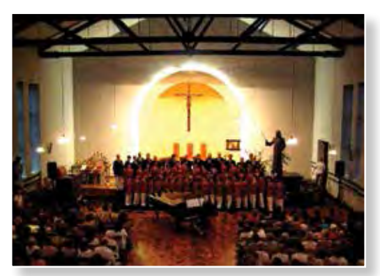
The Philadelphia Boys Choir & Chorale sings in Lithuania.

Home to 13 UNESCO World Heritage Sites , the Baltics, with their astonishing emphasis on choral music, made it easy for the Philadelphia Boys Choir and Chorale to immerse themselves in the fantastic culture of the region. The tour ranged from collaborations with some of the Baltics' best musical ensembles to performances