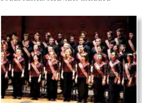
The New Zealand Secondary Students' Choir sings in Pretoria as part of the Ihlombe! Festival.

The 2012 Ihlombe! South African Music Festival celebrated its fourth season by exchanging choral traditions between South Africans and choirs from Belgium, Australia, New Zealand, and the United States. 5 international choirs and 9 South African choirs gathered for 14 concerts and 5 workshops throughout South Africa. Activities included