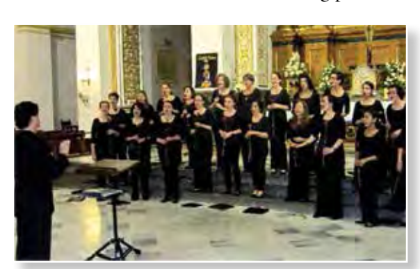
The Smith College Chamber Singers perform in Motril, Spain.

In addition to such outstanding performances, the Smith