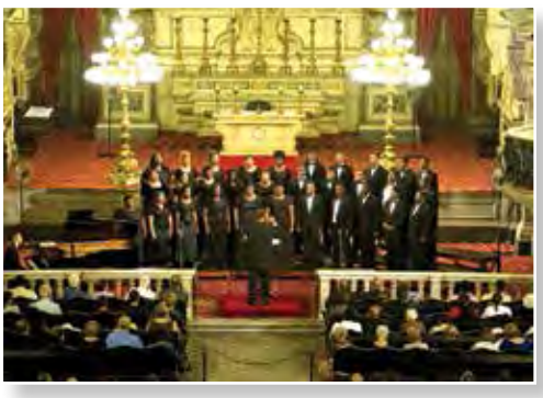
The Morgan State University Choir impresses the audiences at Rio de Janeiro's Candelaria Church.

The choir also experienced what they said was "perhaps the best exchange opportunities [they] had ever had," when in São Paolo they met and sang with students at their sister school, Zumbi dos Pamares, the only Afro-Brazilian college in the country. Additionally, in Rio de Janiero they sang a concert with young music students in