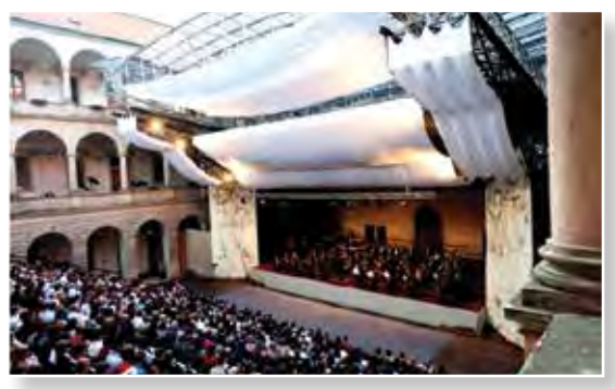
Smetana's Litomyšl Festival of the Czech Republic is filled with the sounds of the Greater Dallas Youth Orchestra.

EXECUTIVE DIRECTOR, GREATER DALLAS YOUTH ORCHESTRA