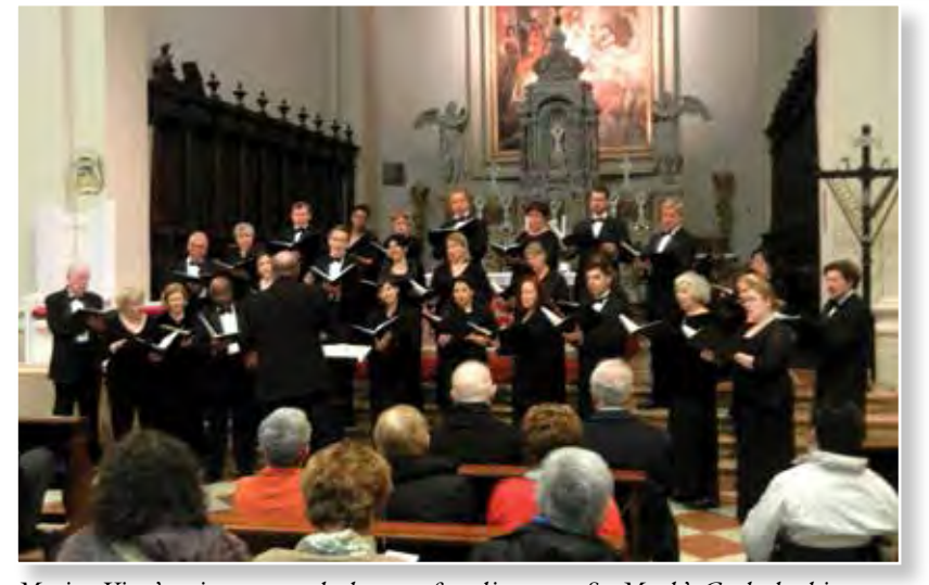
Musica Viva's voices warm the hearts of audiences at St. Mark's Cathedral in Pordenone, Italy.

"Classical Movements provided excellent service for our tour of Italy, beginning during the planning stages prior to the tour, and continuing through every aspect of our trip: concerts, excursions, and guides. They took care of all the details, allowing us to concentrate on the music and on enjoying our time in Italy. Thank you again for a wonderful experience, Classical Movements!"