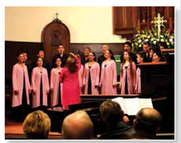
Schola Cantorum Coralina (Cuba) performs in Annapolis, MD as part of the Serenade! International Choral Series.

Building on the success of the Serenade! Washington, DC Choral Festival that takes place at the end of June each summer, Classical Movements is proud to announce that special, unique and leading choirs from abroad will be brought to Washington, DC during the normal concert season as part of the Serenade! International Choral Series. The inaugural