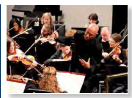
National Symphony Orchestra performing in Port of Spain.