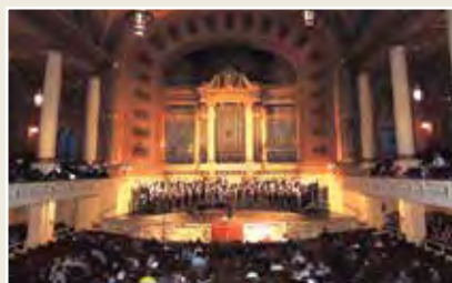
◀ The World Premiere of A Porter's Song at Woolsey Hall performed by the Yale Glee Club