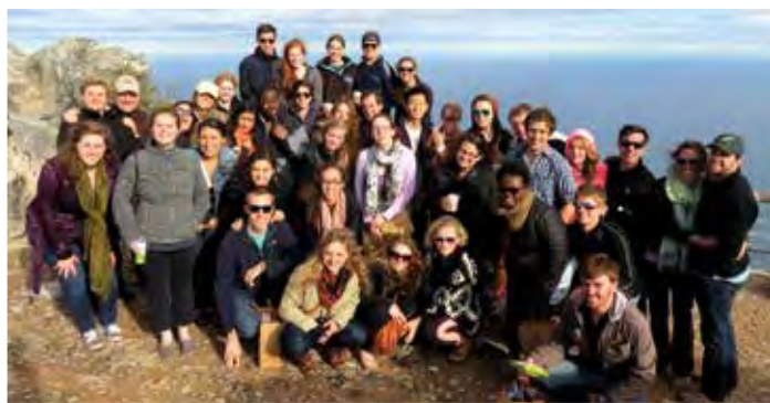
The George Washington University Singers on top of Table Mountain in South Africa