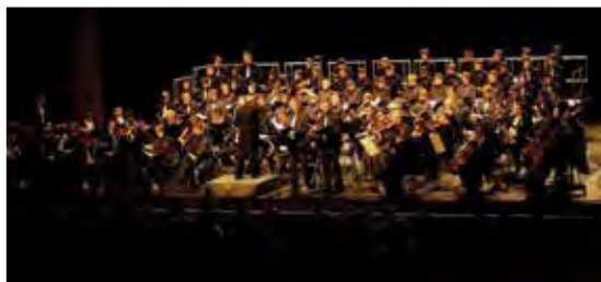
Pacific Boychoir performing with the Brazilian Symphony Orchestra

many great highlights of this 16-day tour with 10 concert performances was a collaborative performance of Mozart's Requiem with the renowned Brazilian Symphony Orchestra .