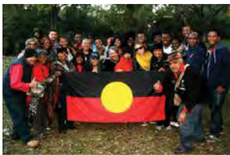
Morgan State University at an Aboriginal presentation at the Royal Botanic Gardens in Melbourne, Australia