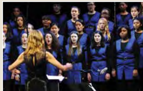
The Brooklyn Youth Chorus went on a concert tour to Ohio