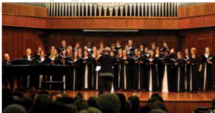
The George Washington University Singers at North West University in Potchefstroom

performed repertoire from Gershwin to Copland, Barber to Bernstein, and more! A service project and many cultural exchanges were also held in addition to performances in Cape Town, Johannesburg, Gugulethu, and Potchefstroom. 🇿🇦