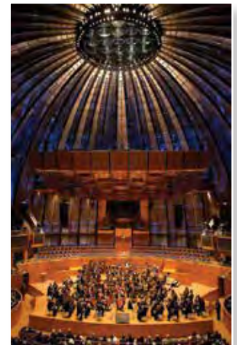
National Symphony Orchestra performing at Tonhalle in Düsseldorf, Germany

“Winds entered gorgeously, the strings were as cohesive as I have ever heard... Enthusiastically received.” 🍷