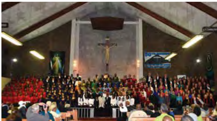
Ihlombe! Festival choirs join together to perform for a full audience at the historic Regina Mundi Church

"A life-changing cultural, social and educational opportunity to travel to another country."