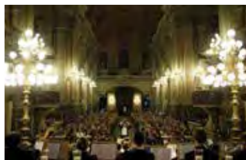
A view from the stage of Yale Symphony Orchestra's performance at Rio de Janeiro's Candelaria Church

The Yale Symphony Orchestra delighted in experiencing incredible outings, including a