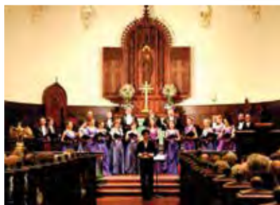
Serenade! Festival features Poland's Wroclaw Philharmonic Choir