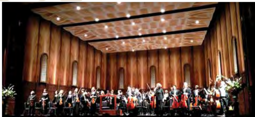
St. Louis Symphony performing at California's Granada Theater

This is the second California tour for the Symphony and comes on the heels of their September 2012 concert tour of Europe, with travel arranged for all tours by Classical Movements. 🎵