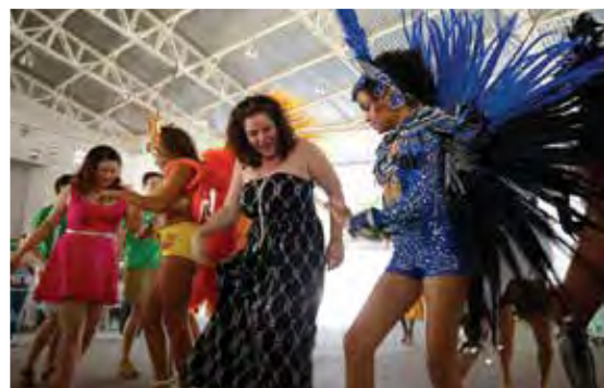
Yale Symphony Orchestra musicians learning the samba