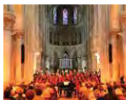
A full audience at the Cathédrale de Lisieux, France, for Philadelphia Boys Choir and Chorale

Classical Movements is pleased to have arranged this 5th concert tour for the Philadelphia Boys Choir and Chorale . 🇺🇸