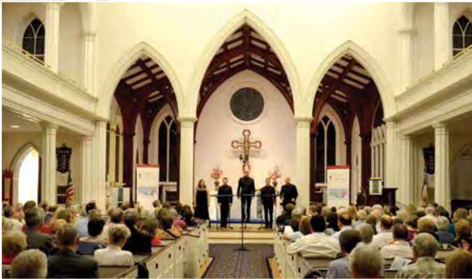
Calmus Ensemble Leipzig gives listeners a unique acoustic perspective by using different locations and formations during their performance at the Serenade! International Choral Series

Calmus' concert was heralded by The Washington Post , which stated, "The group held the audience... nearly spellbound with its artistry." 🎵