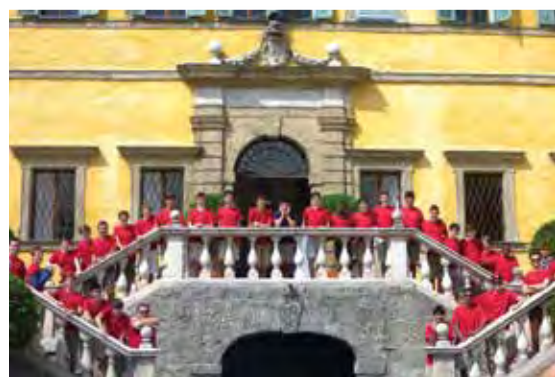
Los Angeles Children's Chorus Young Men's Ensemble in Salzburg