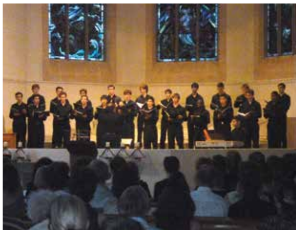
The Los Angeles Children's Chorus Young Men's Ensemble performing at Christuskirchen in Munich, Germany

The Los Angeles Children's Chorus Young Men's Ensemble had their European debut with performances in Germany, Austria, and Italy on a 12-day concert tour. The ensemble undertook several group exchanges, including one with the Munich Opera House and another involving the celebration of the Feast of St. John