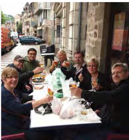
Camerata Chicago members enjoying local food on the streets of Tulle, France after a tour of the historic city