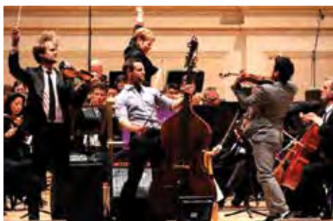
◀ Baltimore Symphony Orchestra performing with Time for Three, a trio of graduates from Curtis Institute.