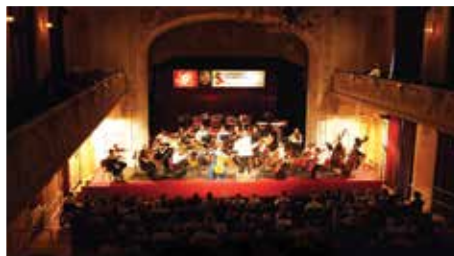
Camerata Chicago performing at Smetana's Litomyšl Festival in the Czech Republic