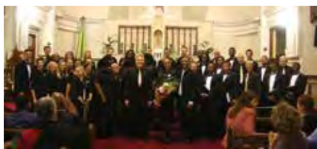
Morgan State University Choir performing in Newcastle, Australia

While in Australia, the Morgan State University Choir also held collaborative concerts with several local universities as well as solo