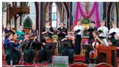
Yale Institute of Sacred Music performing in Burma

Classical Movements was pleased to arrange and promote all concerts, held in some of the most prestigious concert halls, as well as travel logistics for this second collaborative concert tour of students from Yale University and The Juilliard School. Both groups previously