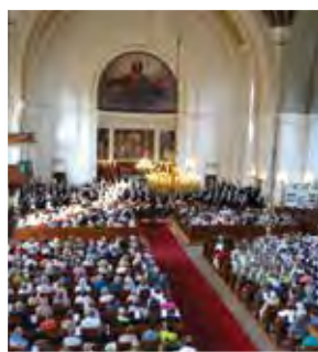
Yale Alumni Chorus sings to a packed house at Kaarli Church in Estonia

All performances were presented as part of major music festivals, concert series, or outreach concerts, and numerous collaborations were held with local ensembles. While performing at Kaarli Church in Estonia, the Chorus collaborated