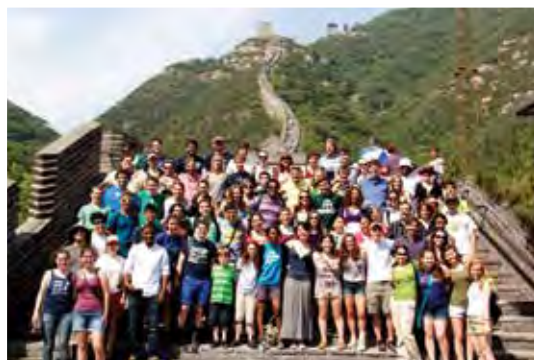
Yale Glee Club at the Great Wall of China