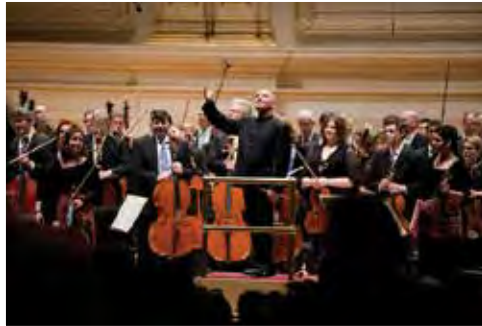
National Symphony Orchestra with Music Director Christoph Eschenbach at Carnegie Hall.

Classical Movements has been arranging concert tours for the National Symphony Orchestra since 1997, and this marks their 27th tour with us. 🍷