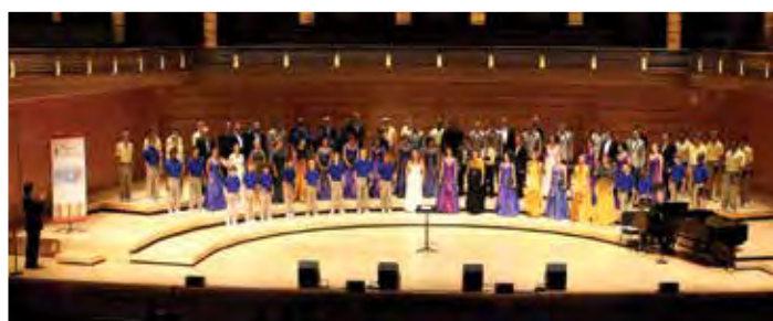
Serenade! Washington, D.C. choirs perform at the Music Center at Strathmore