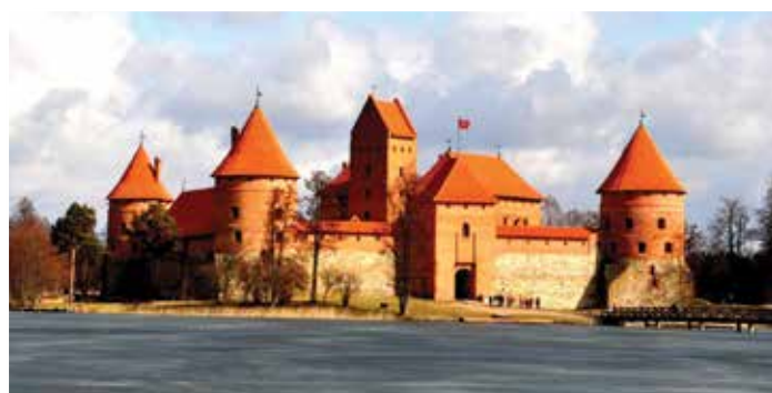
Lithuania's beautiful Trakai Castle