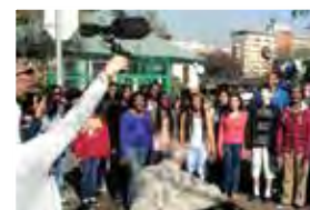
Northwestern High School Choir singing outside the hospital where Nelson Mandela was recuperating during the Ihlombe! Festival. Nelson Mandela passed away just months later