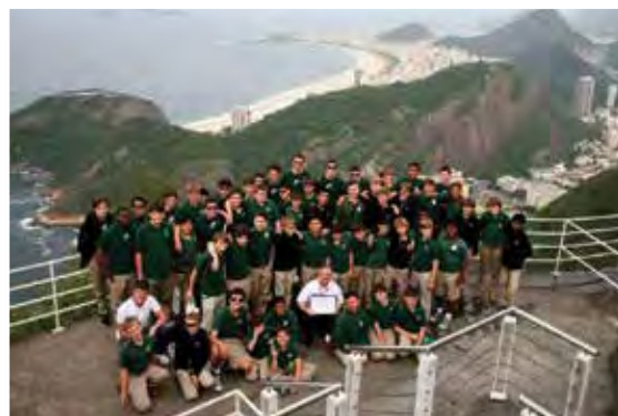
Pacific Boychoir singers delight in the beauty of Brazil

with the Pacific Boychoir not only on this exciting tour to Brazil, but also through the arrangement of their performance at the Nelson Mandela Memorial Service held at the Washington National Cathedral in Washington, D.C. (see page 1). These marked the 11 th and 12 th tours Classical Movements has arranged for the Pacific Boychoir. 🌟