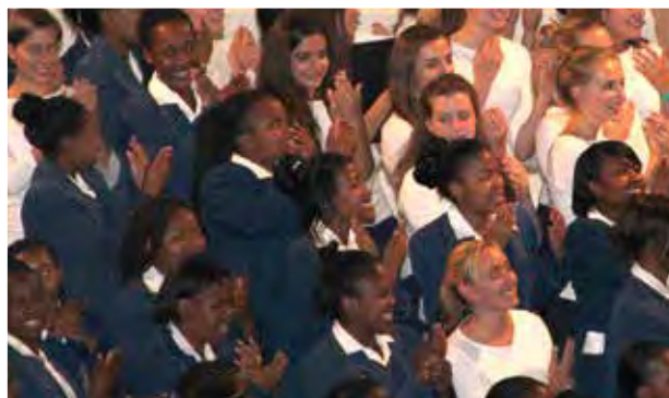
A collaborative performance in Pretoria, South Africa, by the Jugendchor Konservatorium Winterthur and a local girl choir