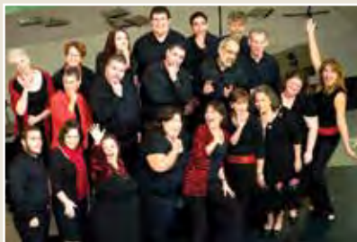
Coral Cantigas traveled to Puerto Rico for a concert tour