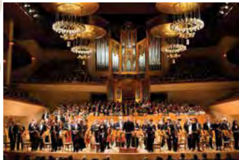
National Symphony Orchestra performing at the Auditorio Nacional de Música in Murcia, Spain.

Under the direction of Maestro Christoph Eschenbach , the National Symphony Orchestra held concerts in Spain, Germany, and France, with a final stop in Oman, where they were the first major American orchestra to perform at the Royal Opera House in Muscat. With a total of nine concerts in premier venues,