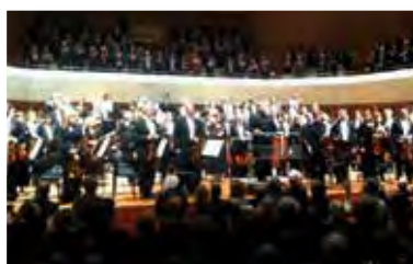
Dallas Symphony Orchestra performing at Eindhoven Muziekgebouw in the Netherlands.