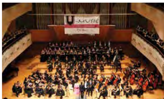
Yale Glee Club takes the stage at the Beijing Concert Hall