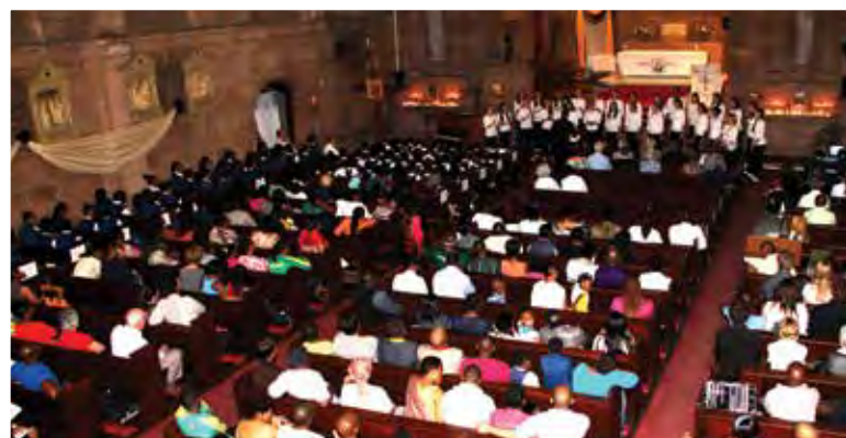
Jugendchor Konservatorium Winterthur performs at the Sacred Heart Cathedral of the Loreto Convent School in South Africa