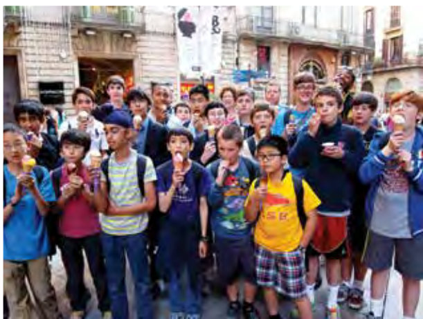
Grace Cathedral Choir of Men and Boys having an ice cream treat after their final concert in Barcelona, Spain