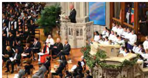
Pacific Boychoir and Morgan State University Choir pictured with Vice President Joseph Biden at the National Nelson Mandela Memorial Service

Given its unique role in spreading South African choral music through the arrangement of South African concert tours and the annual Ihlombe! South African Choral Festival , Classical Movements is proud to have had a part in this momentous service. 🎵