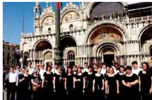
The University of Kentucky Chorale in Italy during their concert tour of Italy and Switzerland

"The University of Kentucky Chorale had a fabulous tour with Classical Movements! It was well-planned and implemented... The tour was a wonderful musical and cultural experience for our students. Classical Movements came through again!"