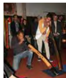
Morgan State University Choir members learning to play the didgeridoo at an Aboriginal presentation in Australia