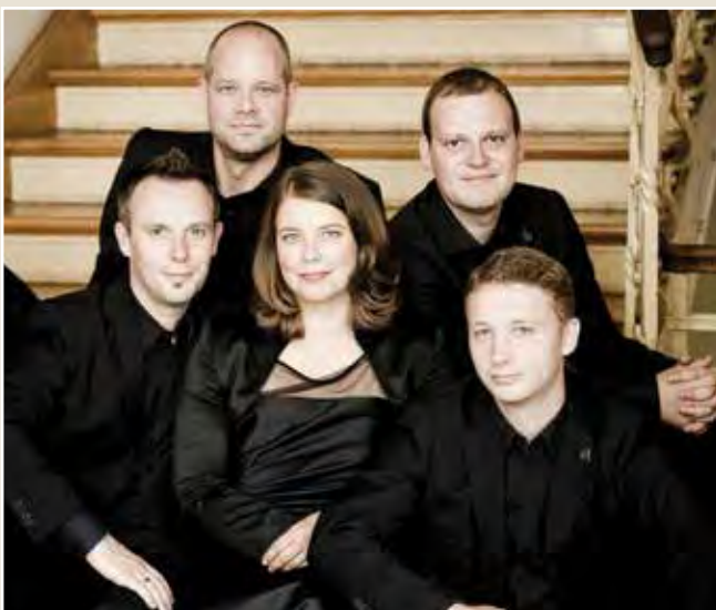
Calmus Ensemble Leipzig

Due to the large volume of positive feedback and requests, the Serenade! International Choral Series is pleased to bring Calmus back to Virginia in the spring of 2014 for an encore performance.