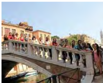
Miami Children's Chorus

During their stay in Italy, the Miami Children's Chorus explored extraordinary museums, toured historical churches, ventured through rustic towns, and of course tasted one of Italy's specialties - pizza! 🍕