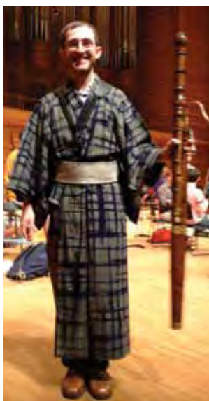
A Juilliard415 member showing off his traditional Japanese outfit