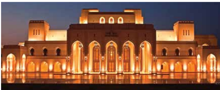
Royal Opera House Muscat