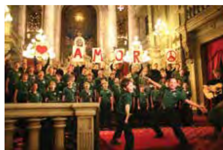
Pacific Boychoir performing at Candelaria Church in Rio de Janeiro, Brazil

With performances in a variety of venues, from strikingly unique halls to traditional cathedrals and churches, audiences fell in love with the Pacific Boychoir and their glorious sound. Besides exciting performances, the boys enjoyed exchanges and workshops with local Brazilians, including one in which they learned how to dance a traditional samba from a group of Brazilian children similar to their own age.