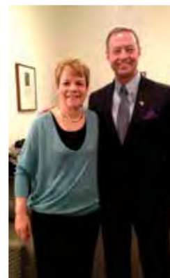
Baltimore Symphony Orchestra's Music Director, Marin Alsop, shown backstage in Carnegie Hall with Maryland's Governor Martin O'Malley

time. Higdon's energetic piece led the audience to wave their banners in an outward show of encouragement and pride in the BSO. Maryland Governor Martin O'Malley was in attendance at the New York City performance and spoke of how the Orchestra enhances its community and stressed the great importance of arts education. Governor O'Malley has previously performed with the BSO. 🍷