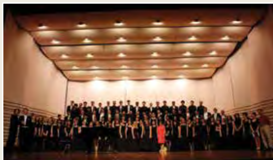
◀ The Asia premiere of A Porter's Song, commissioned by the Eric Daniel Helms New Music Program for and in collaboration with the Yale Glee Club