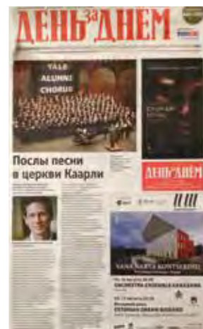
Yale Alumni Chorus featured in a Baltics newspaper

This concert tour marked the Yale Alumni Chorus’ 8th major tour with Classical Movements , as the group has toured previously to Brazil, Argentina, Chile, Peru, the United Kingdom, the Netherlands, South Africa, Mexico, Guatemala, Belize, Cuba, Turkey, Armenia, Georgia, and Russia. 🇺🇸