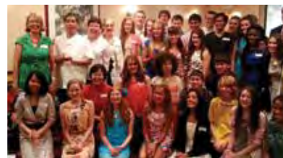
The Minister Counselor for Cultural Affairs attending a reception for the Children's Chorus of Washington in China