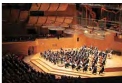
Dallas Symphony Orchestra performing at the Gasteig in Munich.

performed the work in Vienna. Other repertoire included a rotation of Mahler's Symphony No. 6 , Wagner's Prelude and Liebestod from Tristan und Isolde , Steven Stucky's Elegy from August 4, 1964, and R. Strauss' Suite from Der Rosenkavalier . 🍷