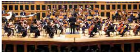
Yale Symphony Orchestra performing at the Sala Sao Paulo, Brazil

and meat stew. Brazil has one of the most unique and diverse cultures on the planet, with its vibrant music reflecting the diversity of ethnic backgrounds that make up the country's resident population. 🇧🇷