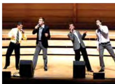
The Watch (Canada) wins over audiences at the Serenade! Festival