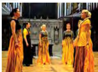
◀ Latvian Voices enchants a full audience at Church of the Epiphany