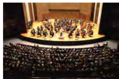
◀ The Harvard-Radcliffe Orchestra performing at the Jerusalem Festival's Beethoven Marathon in Israel

The Orchestra made stops in Bethlehem, Galilee, Haifa, Jerusalem, Nazareth, Tel Aviv, Amman, and Wadi Rum, not only to perform but also to visit historical sites.