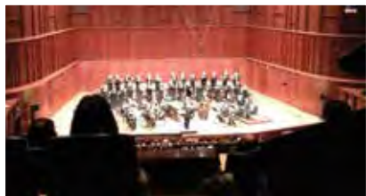
Yale Institute of Music and Juilliard415 at Kawauchi Hall, Japan

Under the direction of Masaaki Suzuki, the Yale Institute of Sacred Music's Schola Cantorum and The Juilliard School's Juilliard415 toured and performed together in Japan, Singapore, and Burma. Four concerts were held in Tokyo, Osaka, and Singapore with packed houses, including over 1,000 tickets sold at the Singapore Esplanade Concert Hall! Suzuki, who is considered to be the world's finest living