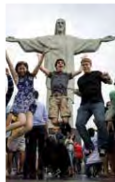
Musicians of Yale Symphony Orchestra at Brazil's Christ the Redeemer statue

day in the culturally diverse city of Sao Paulo, as well as learning some traditional samba steps and grooves at a samba school in Rio de Janeiro, where they were later served feijoada, a traditional bean