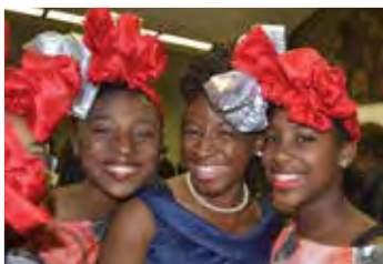
Students from Trinidad and Tobago and the United States at a performance in South Africa during the Ihlombe! Festival

◀ An enthusiastic audience packed the Pretoria City Hall for this vibrant Ihlombe! concert presented in collaboration with The City of Tshwane