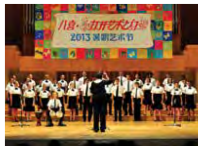
Children's Chorus of Washington performing at the Forbidden City Concert Hall in Beijing.