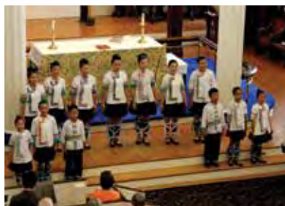
The Dong Chorus (China) performs in Old Town Alexandria, VA, during a Serenade! Festival concert