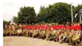
Singers of the Philadelphia Boys Choir and Chorale at a World War II military reenactment during a celebration of the liberation of Saint-Satur

“Classical Movements is top notch. They know what music groups need, and they take care of it all. Every group has different expectations and requirements; Classical Movements is committed to handling all the minute details of a top quality concert tour, while tailoring their services to meet your needs to fit your budget.”