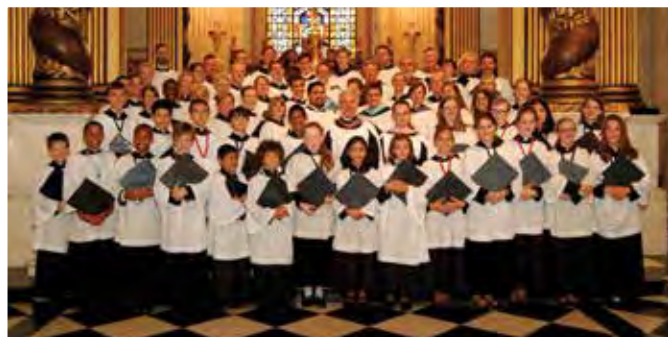
Trinity Church Boston at St. Paul's Cathedral in London