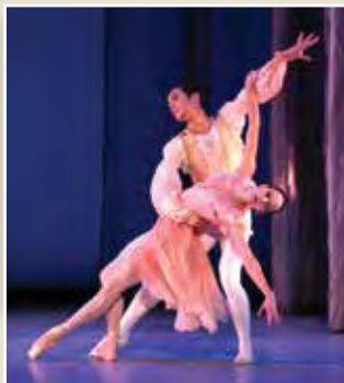
◀ The Suzanne Farrell Ballet Company performed at the Royal Opera House Muscat in Oman