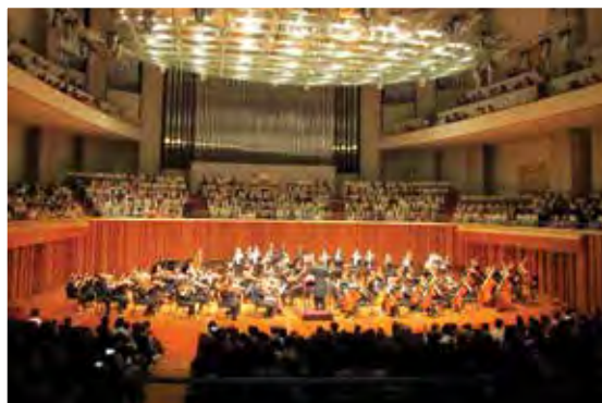
University of Kentucky Symphony Orchestra performing at the National Center for the Performing Arts