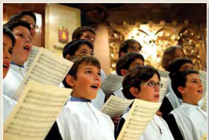
Escolania de Montserrat will be performing at the Music Center at Strathmore in March of 2014 as part of the Serenade! International Choral Series

Additionally, the Serenade! International Choral Series will be presenting the Escolania de Montserrat, a famed boy choir from Barcelona, Spain, at the Music Center at Strathmore in March of 2014. 🎵