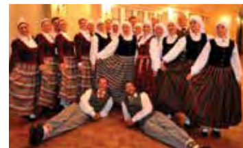
Yale Alumni Chorus learns traditional Latvian dancing