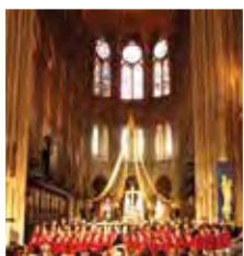
Philadelphia Boys Choir and Chorale at Notre Dame in Paris, France

Each year, France tops the list of the most visited countries in the world, and with good reason. It has a wealth of everything that makes for a great trip: the iconic city of Paris, quaint towns and villages, lovely rural countryside, and breathtaking natural beauty.