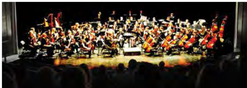
Charlotte Symphony Youth Orchestra at The Atlas Performing Arts Center in Washington, D.C.

▶ Players from the Charlotte Symphony Youth Orchestra outside the U.S. Capitol in Washington, D.C.