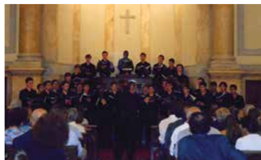
A fine performance in Rome by the Los Angeles Children's Chorus Young Men's Ensemble

highlight of which was singing Mass in St. Marks Basilica in Venice. Additional concerts were held in Munich, Salzburg, the town of Sacile, and Rome. Besides holding excellent concerts, the Young Men had the great opportunity to visit the Vatican to participate in a Papal Audience with then newly appointed Pope Francis. 🇻🇦