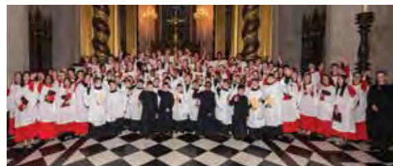
The Choir of Groton School at St. Paul's Cathedral in London during their tour of England and Scotland

Oxford. All of the clinicians are leaders in choral music and provided helpful insight and guidance for the singers. 🇬🇧