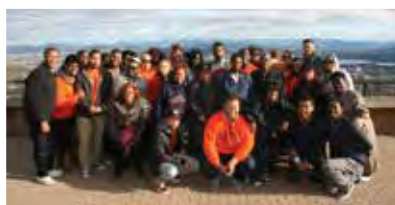
Morgan State University Choir at Canberra's Mt. Ainslee lookout, Australia

Later in 2013, the Morgan State University Choir performed at the Nelson Mandela memorial service held at the Washington National Cathedral in Washington, D.C. The Choir's participation in this incredible event was arranged by Classical Movements. See page 1 for more information. 🌟