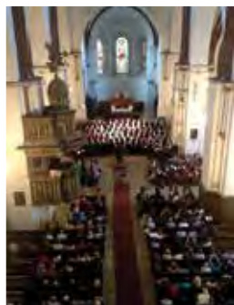
A huge audience at Riga Dome Cathedral in Latvia listens intently to the Yale Alumni Chorus