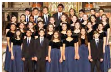
Miami Children's Chorus has a wonderful concert tour of Italy