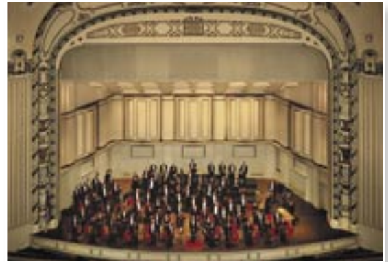
Saint Louis Symphony Orchestra at the Powell Symphony Hall in Saint Louis

They have programmed many works by John Adams including Century Rolls with pianist Orli Shaham, and On the Transmigration of