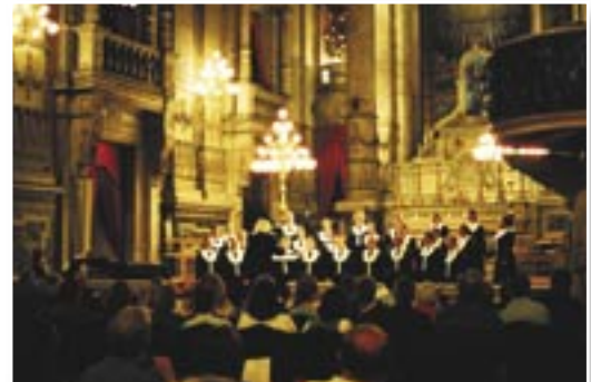
Minnetonka Chamber Choir at Candelaria Cathedral in Rio de Janeiro

Four outstanding children's choirs from North America participated in the inaugural year of Melodia! , Classical Movements' new South American Music Festival. The Children's Chorus of Washington, Miami Children's Chorus, Minnetonka Chamber Choir, and the Winnipeg Mennonite Children's Choir traveled and performed in Brazil and Argentina July 12-24. In Argentina they were joined by the Niños Cantores de Córdoba , a well-known South American children's chorus celebrating their 50th season.