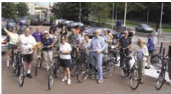
Yale Alumni Chorus Bicycle Tour in The Hague, Netherlands