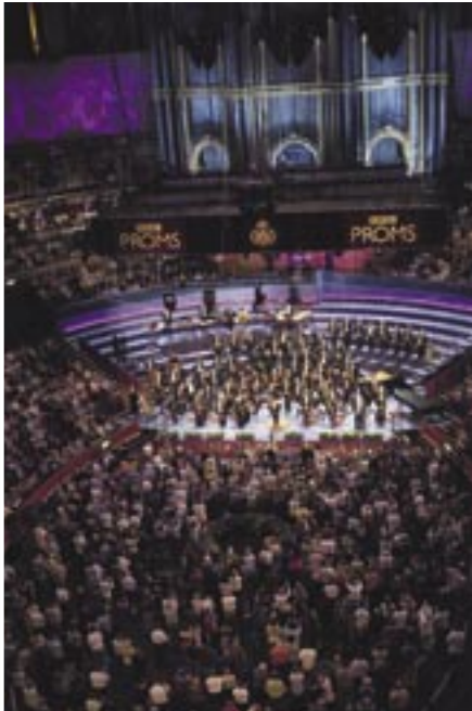
Minnesota Orchestra at the Royal Albert Hall in London

Classical Movements is proud to have surmounted severe UK security restrictions to play a part in Minnesota Orchestra's triumphant festivals tour to Amsterdam, London, Edinburgh, Helsinki and Locarno. They performed at the Concertgebouw, the Royal Albert Hall, the Usher Hall, the Finlandia Hall, and the ancient and acoustically wonderful Church of San Francesco.