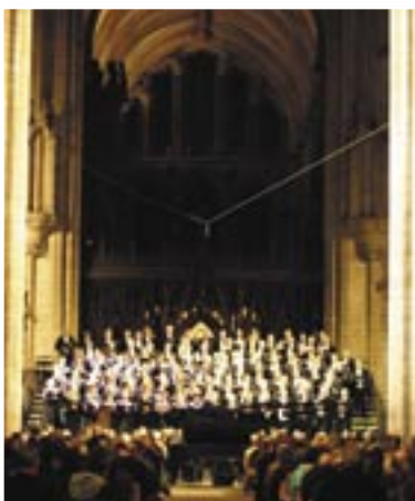
Yale Alumni Chorus at Ely Cathedral in Cambridgeshire