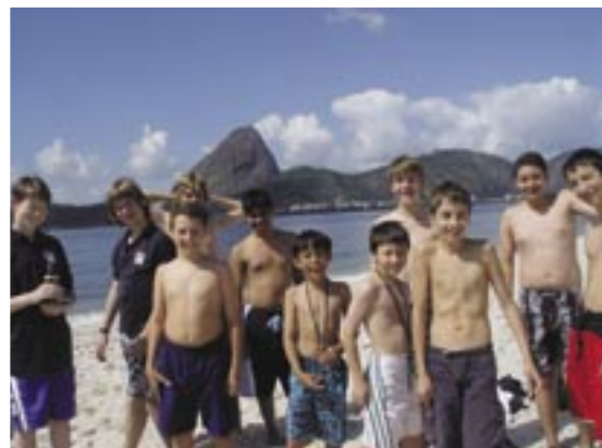
Pacific BoyChoir at Copacabana Beach in Rio de Janeiro

Packed houses and people sitting in the aisles greeted the choir at every stop. The boys bought their share of Brazilian jerseys and saw the sights, including Corcovado, Sugarloaf Mountain, the São Paulo football club stadium, and of course the beach.