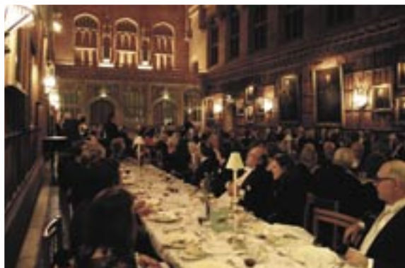
Yale Alumni Chorus Singing Dinner at the Great Hall King's College in Cambridge