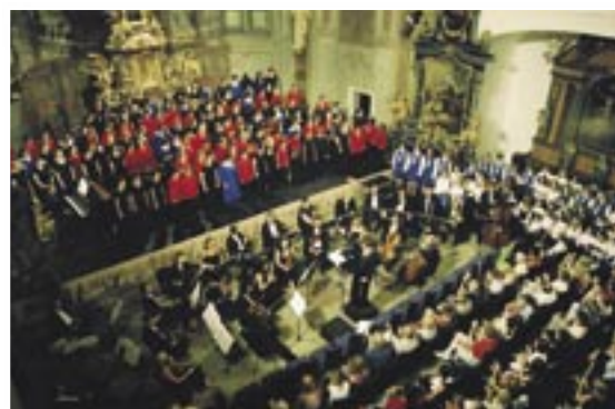
Rhapsody Concert at St. Simon and Judah Church in Prague