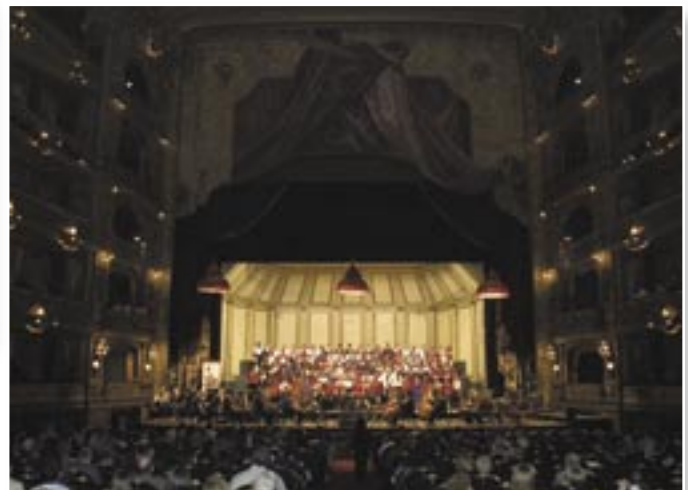
Melodia Concert at Teatro Colon in Buenos Aires