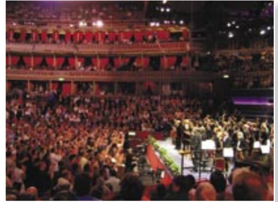
The Minnesota Orchestra at the Royal Albert Hall in London

The orchestra was the one chosen to play the annual Sibelius Violin Concerto at the Helsinki festival with Russian violinist Viktoria Mullova . Her experiences getting her Stradivarius violin in and out of Heathrow