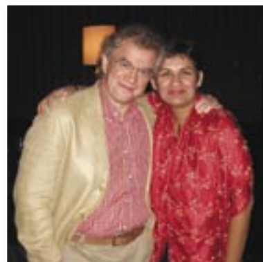
Osmo Vänskä and Neeta Helms on the Minnesota Orchestra Europe Tour