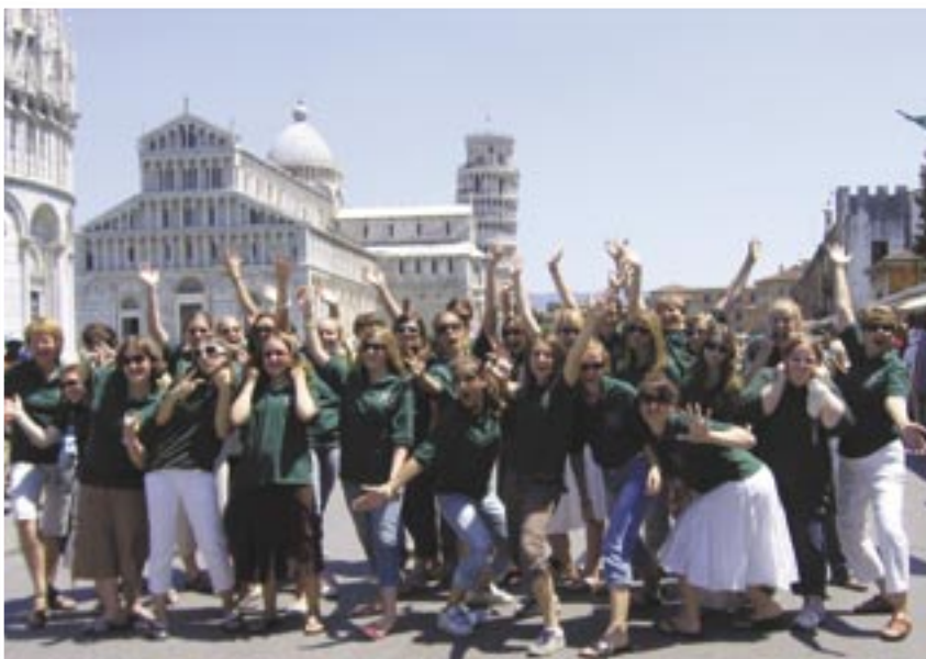
Children's Chorus of Sussex County at the Leaning Tower of Pisa

Follow in the footsteps of the Choral Arts Society , Lexington Singers , the Alban Chorale , Children's Chorus of Sussex County , Ithaca Children's Choir , Holy Cross College Choir , Cantaré Children's Choir , Smith College Chamber Singers , Yale Glee Club , Oregon Repertory Singers and many more who have traveled to Italy with Classical Movements for their concert tour. 🍷