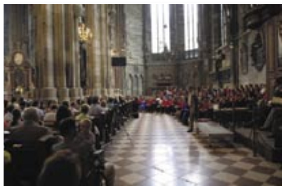
Rhapsody Concert at St. Stephan's Cathedral in Vienna