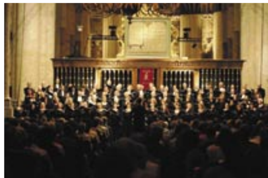
Yale Alumni Chorus at the Pieterskerk in Leiden

masterpieces, windmills, pancakes on traditional Delft pottery and a finale dinner cruise of Indonesian cuisine on an old steamship in the world's biggest port, it was a tour to remember. 🍷