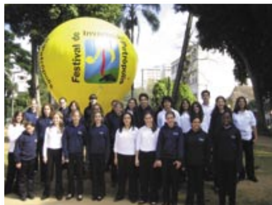
Miami Children's Chorus at the Winter Music Festival in Petrópolis, Brazil