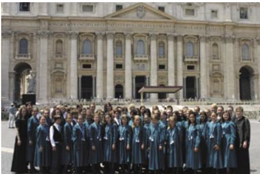
Cantaré Children’s Choir at St. Peter’s Basilica in Rome

Perhaps no country on this planet has given the world more cultural icons, including fine automobiles, architectural styles, fashions, operas, painting, sculptures, tenors, and we certainly can’t forget food and world-championship soccer teams.