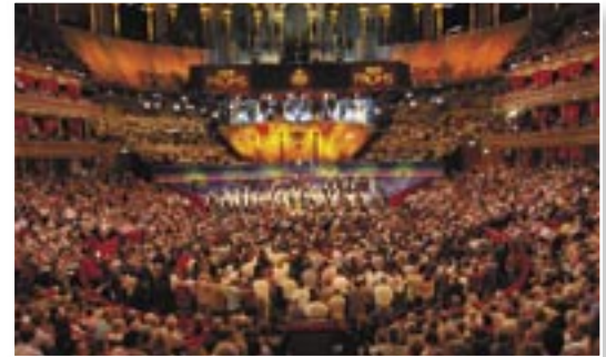
The Philadelphia Orchestra at the BBC Proms in London