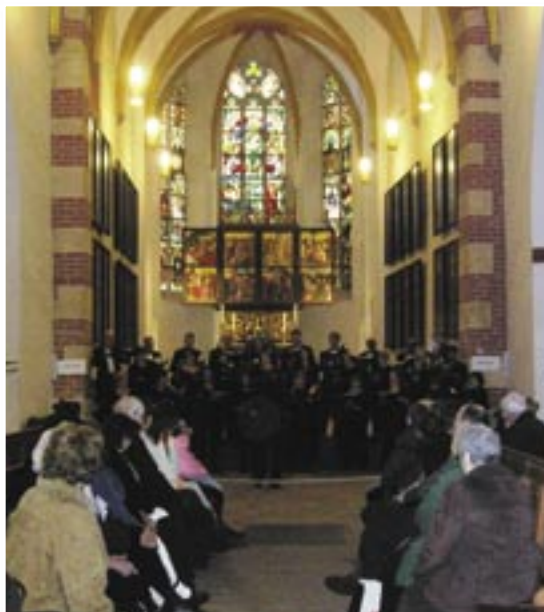
■ Musica Viva at Bach's Thomaskirche in Leipzig

The chorus is currently in Europe for the second time since 2004 and in Germany for the first. Besides being here, the chorus also spent time in Leipzig. Today the musicians are giving a concert in Dresden, before they journey on to Prague. The fact that, between the state's chief trade and capital cities, they came to a small town like Bockelwitz, is thanks to Polditz's good reputation as a musical cultural center. "I heard that there was something like this here between these two big cities, and so I made an effort to get a performance date, because I wanted to show the singers something different, something rural," states choral direc-