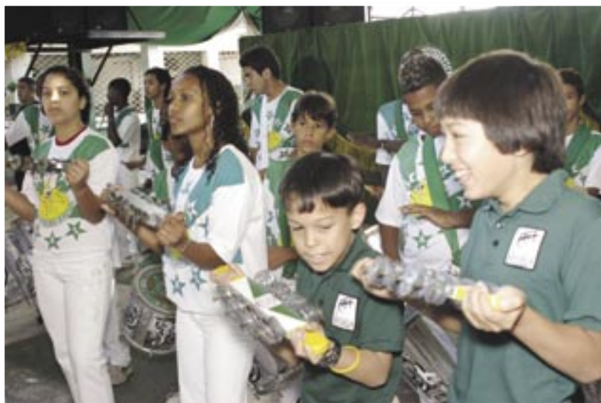
Pacific BoyChoir at the Samba School