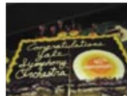
Yale Symphony Orchestra Celebrates 40th Anniversary