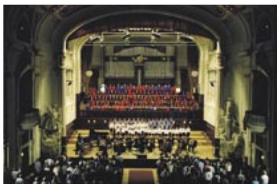
Rhapsody Concert at Smetana Hall in Prague