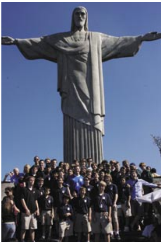
Pacific BoyChoir at Corcovado in Rio de Janeiro