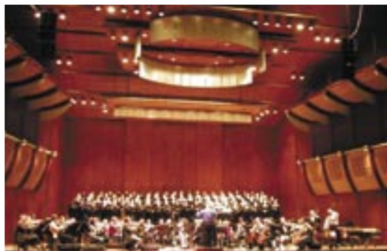
Cathedral Choral Society, Constantine Orbelian and the Philharmonia of Russia in Rehearsal at the Lincoln Center in New York City

The Concert at the Barbican Center in London