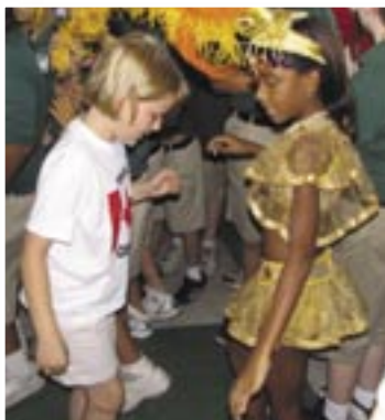
Dancer and Winnipeg Mennonite Children's Choir at the Samba School