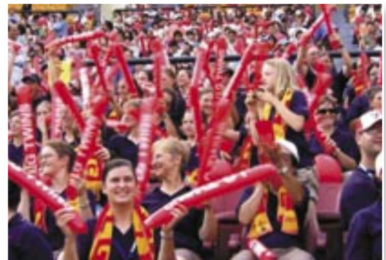
Spirit of America Band at the LG Twin Baseball Game in Seoul

The Wind Opera “Quest for Honor” was presented as a gift to the Korean people at the Daegu Opera House , Daejeon Culture and Arts Center , Chungmu Art Hall and the USO Yongsan U.S. Military Base in South Korea. The unique three-act instrumental opera was enacted on stage by an ensemble of 70 musicians who portray characters in a mythical story. Blending instruments, choreography, dance, costumes, and artistically painted sets, the wind opera was a sweepingly colorful musical presentation. 🍷