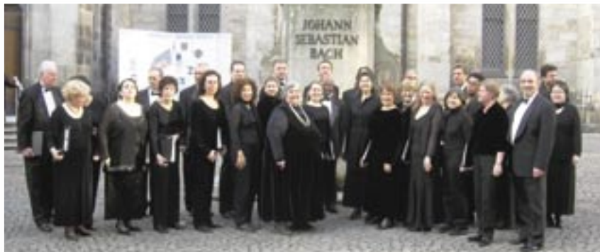
■ Musica Viva at the Thomaskirche in Leipzig