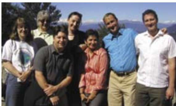
Minnesota Orchestra and Classical Movements Staff in Lugano, Switzerland