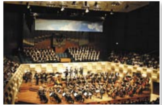
Gergiev Festival at de Doelen in Rotterdam