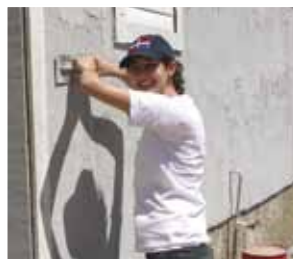
Painting and finishing one of 60 houses

A volunteer crew completed the construction of 60 new homes for local residents from Cañafistol, whose entire village was being relocated to Vallejuelo from a flood plain.