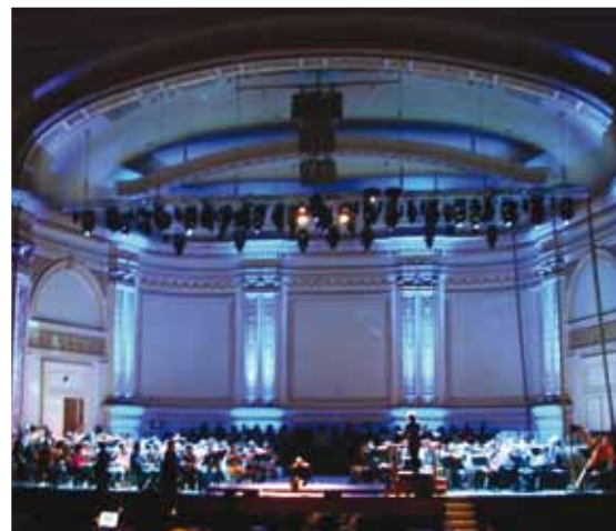
Baltimore Symphony Orchestra at Carnegie Hall

February '08 trip was the spectacular Carnegie Hall debut for conductor Marin Alsop