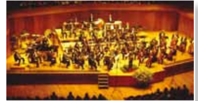
Philharmonic Orchestra of the Americas at Sala Nezahualcóyotl