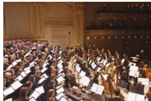
Atlanta Symphony Orchestra at Carnegie Hall