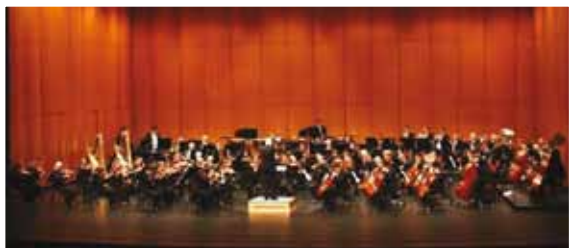
Vancouver Symphony Orchestra