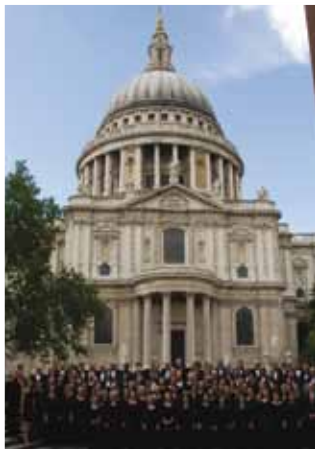
Choral Arts Society of Washington outside St. Paul's Cathedral in London

performances at St. Paul's Cathedral both SOLD OUT! "From under the Dome, this was a marvelously convincing and hugely powerful performance, which was both stirring and moving. The dramatic contrast between massive choral-and-orchestral