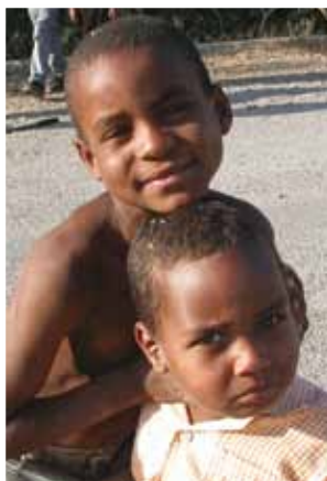
Dominican Republic children

The third group of Doctors and nurses and volunteers traveled to remote villages and offered clinical and diagnostic services to people in desperate need, and helped distribute donated medical supplies as well as medical exams . The expedition was led by experienced medical personnel who were familiar with the region and had previously visited the villages. Classical Movements is very proud to be partnering with the AYA on our first service tour. 🍷