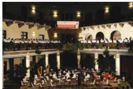
Performance at Riva del Garda

The choir kicked off their tour by singing in an important music series. Following this concert, the choir traveled to Riva del Garda to perform at the festival . The Choir was privileged to perform at the Pordenone Cathedral . The choir's final formal concert was held at St. Francis Church . While there, the Mayor of Costacciaro asked the chorus to sing a ten-minute concert at the sight of a tower which had just been restored and dedicated that afternoon. For the final portion of the trip, the Children's Chorus of Washington had the