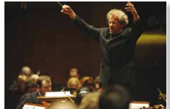
Osmo Vänskä conducts the Minnesota Orchestra

And speaking of the future, it does indeed look bright for The Minnesota Orchestra, as Maestro Vänskä has extended his tenure with the Orchestra through 2011. Orchestra and conductor together have generated quite a buzz in the music world as they are now ranked among the top American symphonic ensembles under Maestro Vänskä. ♥