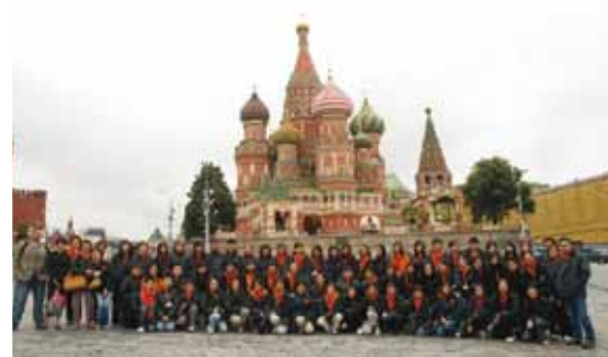
Hong Kong Children's Chorus in front of the Kremlin

When not performing, the Hong Kong Children's Choir took a much awaited tour of the Kremlin . On other days off, they took tours of Moscow and Moscow State University, as well as Vladimir and Suzdal, two picturesque medieval Russian towns. During their last few days in Russia, the choir toured the wondrous city of St. Petersburg . St. Petersburg was built to capture the best of Paris and