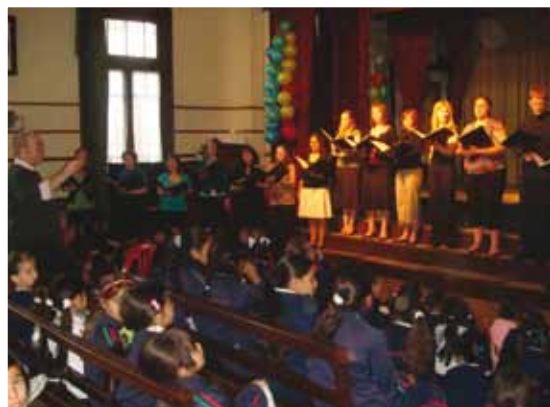
University of Manitoba Singers performing for a girls' school in Buenos Aires