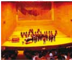
Pacific BoyChoir in San Juan

The Pacific BoyChoir had 3 incredible concerts in Buenos Aires and La Plata.