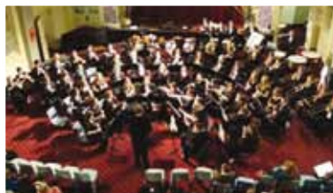
Northwestern College Symphonic Band