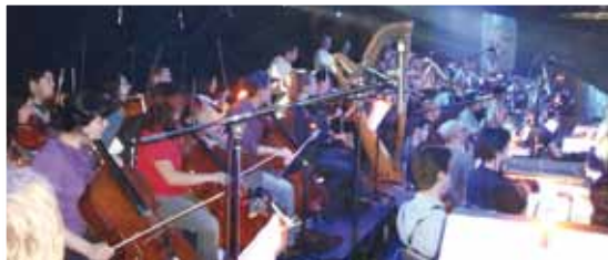
Philharmonic Orchestra of the Americas playing at the Latin Grammys

Following Houston, P.O.A. traveled south to Mexico City . There, the orchestra presented a triumphant concert at the Sala Nezahualcóyotl where they performed works