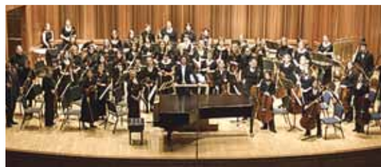
Smith College Orchestra

The Smith College Orchestra performed a concert at the Palazzo Steri in collaboration with the University of Palermo Choir . They held concerts at the Teatro del Mare in Menfi and the Auditorium "A Volta" in Montedoro. The orchestra's final two concerts were in collaboration with the Coro ad Dei Laudem in Carlentini and Cappella Musicale del Duomo di Catania .