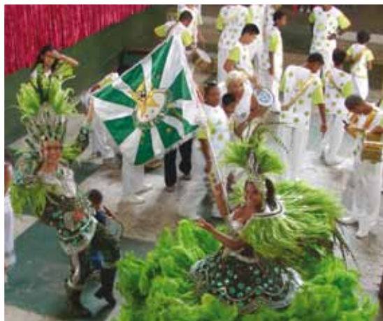
Samba School performers