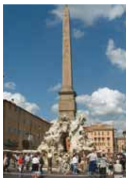
Rome - Piazza Navona