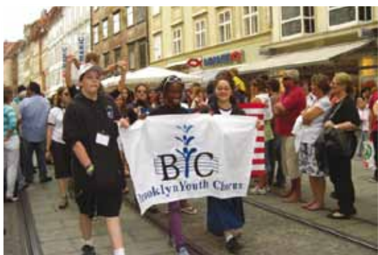
Marching in the World Choir Games Parade