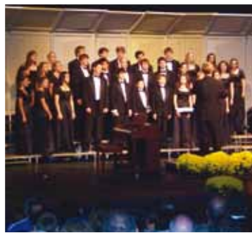
Lexington Catholic High School Choir

stands, the Sistine Chapel and Vatican Museums and attended the Papal Audience at St. Peter's Square at the Vatican . 🇻🇦