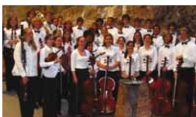
Rock Church, Helsinki

After a few days in Copenhagen, the orchestra left for Oslo, Norway, where they visited