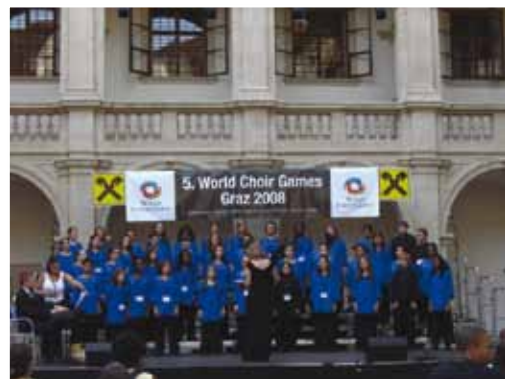
World Choir Games Outdoor Concert

When not competing in the festival, the Brooklyn Youth Chorus embarked on sightseeing tours of Vienna including Belvedere Palace and Gardens, the Ringstrasse and then crossed the Danube and Old Danube. The choir also enjoyed a city tour of Stephan's Square, Graben-square, Michealsquare, Hofburg Palace courts, Burg and Volksgarden with Statue of "Sisi". While there, the Chorus met the Vice Mayor of Vienna at City Hall where they were treated to Viennese sausages. The choir then gave a concert hosted by a local University Choir. "Our performance at the University of Vienna exceeded even our expectations. The Chorus sounded lovely in the beautiful concert hall and an audience of over 300 Viennese gave us lengthy applause after our hour-long concert." 🍷