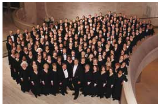
Dallas Symphony Chorus

Classical Movements has 17 years of extensive successful experience in planning concert tours to 135 countries in 6 continents. Contact Classical Movements today to get your touring plans started! ♥