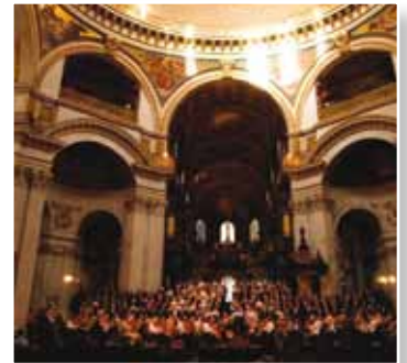
Choral Arts Society of Washington and the London Symphony Orchestra inside St. Paul's Cathedral, London

Congratulations to the Choral Arts Society of Washington having received such a prestigious invitation to London by a great orchestra and conductor. ♥