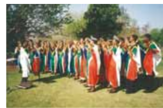
Imilonji KaNtu Choral Society