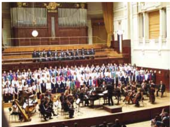
Rhapsody! Final Concert at Smetana Hall