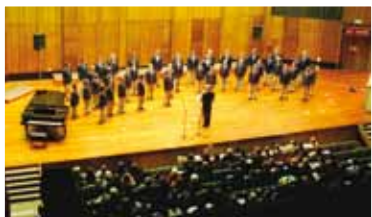
Florida's Singing Sons performing at Linder Auditorium

Church in Alexandra and sang High Mass at St. George's Cathedral, the church of Nobel Peace Prize Winner Bishop Desmond Tutu.