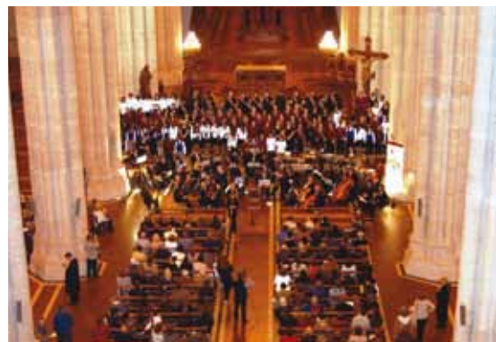
Participating choirs at La Plata Cathedral

ough music. Another high point of the festival was the visit to a music school, where festival choirs attended Brazilian instrument demonstrations by young Escola students where they were serenaded by the most amazing choir of 6-11 year olds. The festival choirs taught Maori and American pieces from their own repertoire to the Escola children's choir.