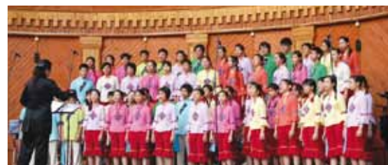
Hong Kong Children's Chorus performance

Venice. There they saw Smolny Convent, the Pushkin Theater , the grand Kazan Cathedral, and the richly gold plated St. Isaac's Cathedral. The Choir traveled along Nevsky Prospekt and saw the Winter Palace of Russian Czars and the Palace Square. 🍷