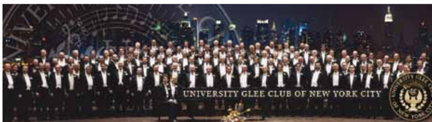
University Glee Club

When not performing in one of their 18 concerts, the YPC explored downtown Vancouver. They were even invited to a BBQ on the Powell River Bay by the Mayor . On their last day in Canada, the Chorus sailed around the area, from Salt-ery Bay to Earls Cove, Langdale Ferry Terminal to Horseshoe Bay.