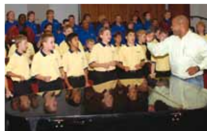
Workshop at St. John's College

skeleton was found. One of the highlights of the trip was their safari tour in Krugersdorp Game Reserve. ♥