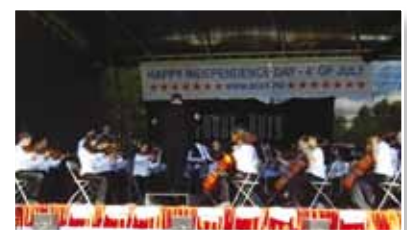
Concert at Tivoli Gardens, Copenhagen

"The farewell concert was everything we'd hoped it would be. We had a spectacular venue, the Rock Church. It was very well-attended by an enthusiastic crowd and the orchestra performed at their best. It was a wonderful final chapter of what has been an incredible journey." 🐨