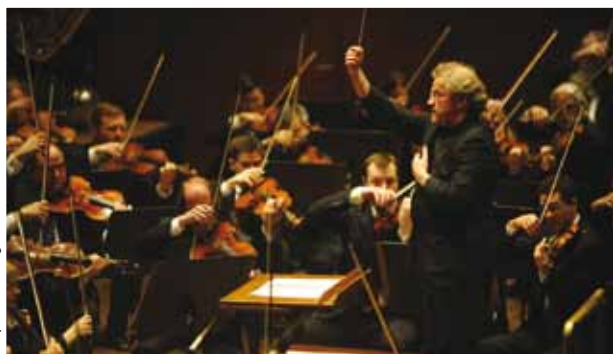
Minnesota Orchestra at Lincoln Center's Avery Fisher Hall