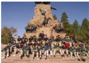
Florida's Singing Sons in South Africa