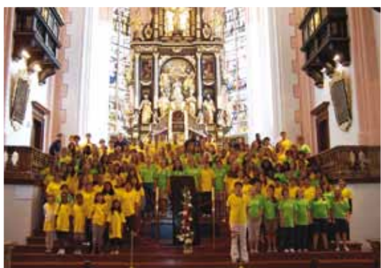
2008 Rhapsody! Choirs at the Wedding Church

Audiences deeply treasured and applauded the individual choir's concerts, held in such acclaimed venues as St. Andrä Church in Salzburg, Beethoven Hall in Vienna and St. Nicholas Church in Prague. The choirs were