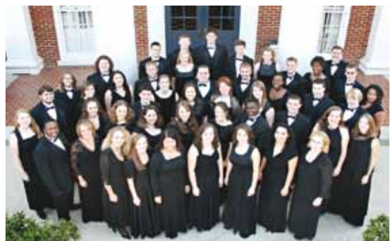
The Shorter Chorale

The Shorter Chorale experienced a taste of everything Italian including St. Mark's Square in Venice, the Vatican , the Colosseum and the Leaning Tower of Pisa .