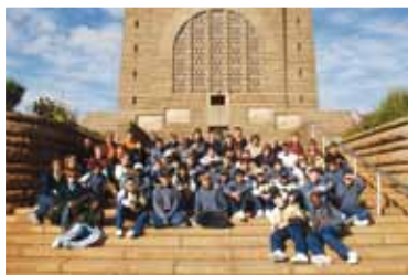
Florida's Singing Sons on the Voortrekker Monument

Church in Alexandra and sang High Mass at St. George's Cathedral, the church of Nobel Peace Prize Winner Bishop Desmond Tutu.