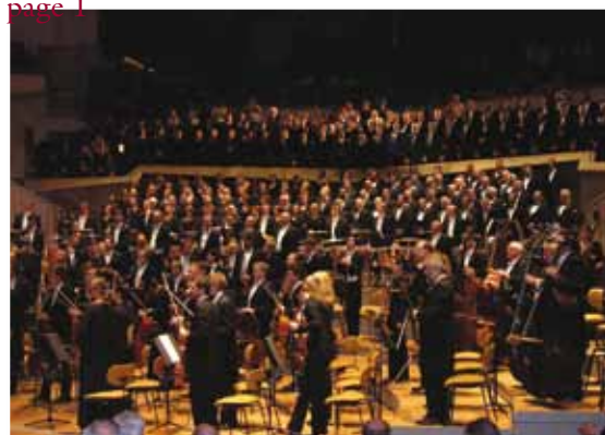
Atlanta Symphony Orchestra in Berlin

These concerts marked the Atlanta Symphony Orchestra Chorus' second collaboration with the German orchestra. In December 2003, the ASO Chorus made their debut with