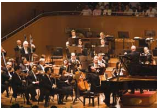
Pianist Lang Lang and the Philadelphia Orchestra

A full house greeted The Philadelphia Orchestra at the Cultural Palace of Nationali-