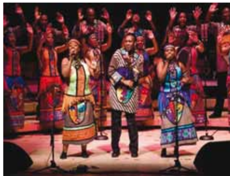
Soweto Gospel Choir

The premise of the Ihlombe! festival is to offer South African audiences an opportunity to hear the most diverse and exciting South African and American choral groups. Each concert will have different choirs participating with their own music repertoire and conductors. Each concert will end with a South African piece learned at workshops and conducted by leading South African conductors.