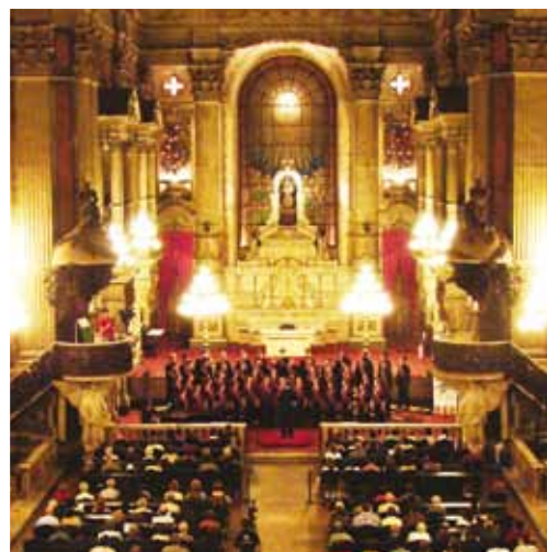
Participating choirs at the Candelaria Church

Without a doubt, one of the most significant moments in Brazil was the cultural outreach and exchange at the a local Samba School , in which several choirs joined Brazilian students from the Samba School. Through vibrant singing, dancing, and drumming, young people from different continents proudly shared their cultures thor-