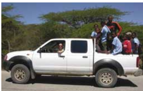
Volunteers heading off to work

The third group of Doctors and nurses and volunteers traveled to remote villages and offered clinical and diagnostic services to people in desperate need, and helped distribute donated medical supplies as well as medical exams . The expedition was led by experienced medical personnel who were familiar with the region and had previously visited the villages. Classical Movements is very proud to be partnering with the AYA on our first service tour. 🍷