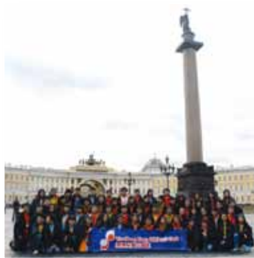
The Hong Kong Children's Chorus in Palace Square

While in Russia, the Hong Kong Children's Choir was privileged to have a workshop with the renowned conductor of the Schnittke Music Academy as well as a workshop with the conductor of a famous Children's Choir in St. Petersburg .